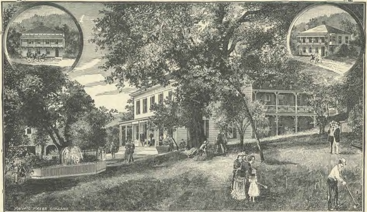
RURAL HEALTH RETREAT, ST. HELENA, CAL.

T HIS delightful and popular Summer Resort has been fitted up as a Sanitarium, and offers unrivaled advantages to all classes of invalids. It is situated on the side of Howell Mountain, 1,200 feet above tide level, 500 feet above and overlooking Napa Valley, and two and a half miles from St. Helena, in Napa County. ITS NATURAL ADVANTAGES are equal to those of any other health resort. It is noted for its pure water, dry atmosphere, clear and balmy sunshine, even temperature, mild breezes, and the absence of high winds. OUR REMEDIAL MEASURES include various forms of Baths, Galvanic and Faradic Electricity, Mechanical Appliances, and exercises for the development of the Lungs, Vital Organs, and Muscular System, the Expansion and Development of the Chest, and the Cure of Deformities.