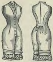
Misses' Combination Waist and Drawers.