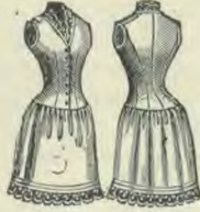
Misses' Combination Waist and Skirt.

N. B.—Patterns of the above-described garments may be obtained of the Rural Health Retreat, St. Helena, California.