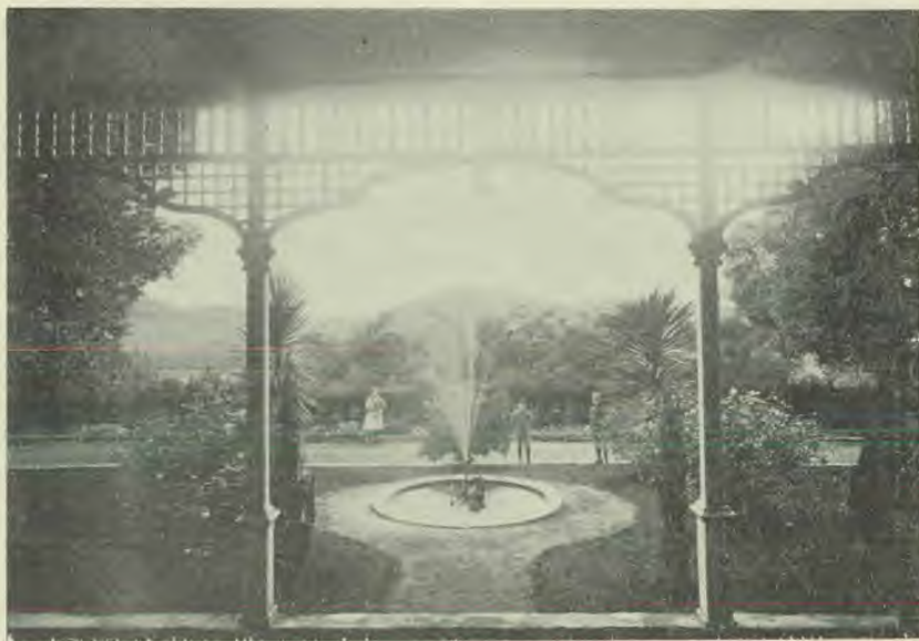
Goldfish play about in the sparkling waters of the fountain.

A cheerful habit of mind is encouraged in all the sanitarium plan of life. Croquet balls roll here and there to the sound of merry voices, and both pleasant and profitable are the morning and evening gymnasium exercises under skilled leadership. Semi-weekly parlor lectures and a weekly cooking class are among the means employed to instruct and train in hygienic