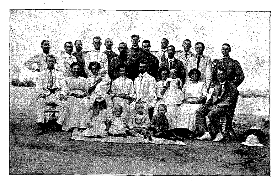
ANNUAL MEETING OF THE WORKERS OF VICTORIA NYANZA MISSION, JANUARY 14, 1914.