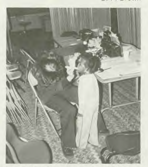
One of the registered nurses examining a patient of the clinic.