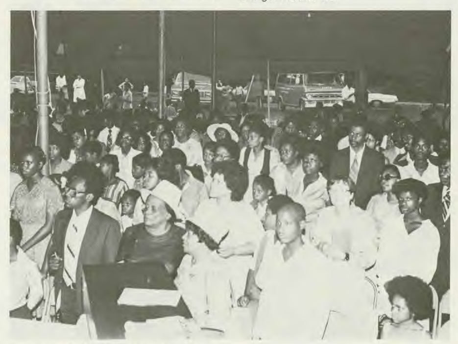
Portion of a Sabbath audience under the tent.