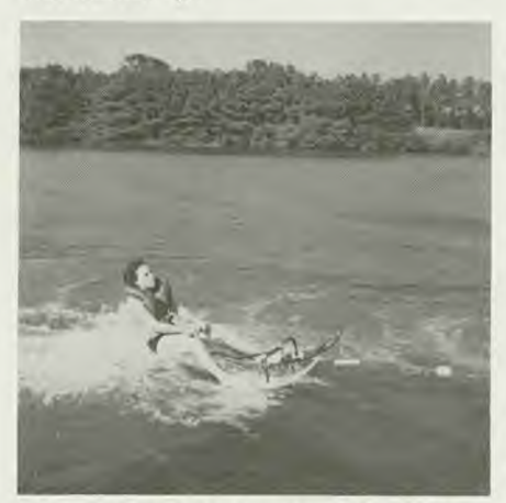
Who said that the blind couldn't ski?

Activities consisted of devotion, crafts, water sports, table games, nature walks, archery, Indian Art, good food and fellowship.