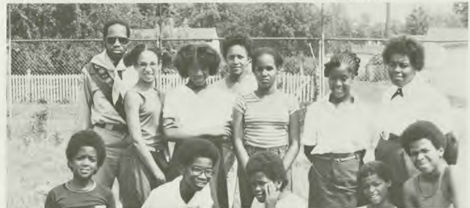
The Cougar Pathfinder Club.