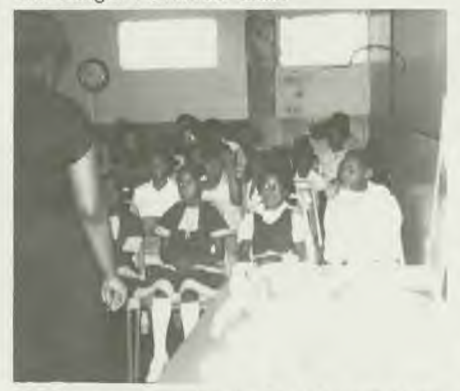
Closing exercises for the Park Avenue Vacation Bible School.