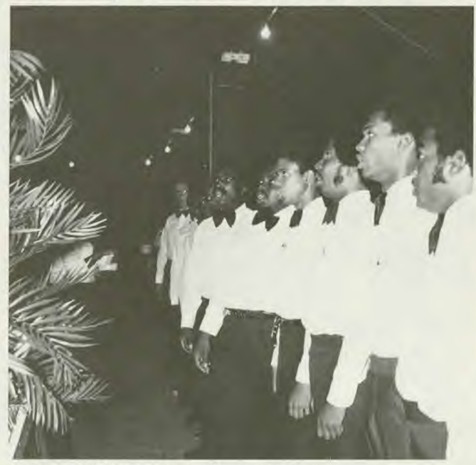
150-Voice Choir sings for the Huntsville Crusade.