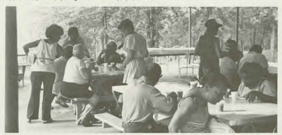
The blind enjoy good refreshments at Camp Lone Star.