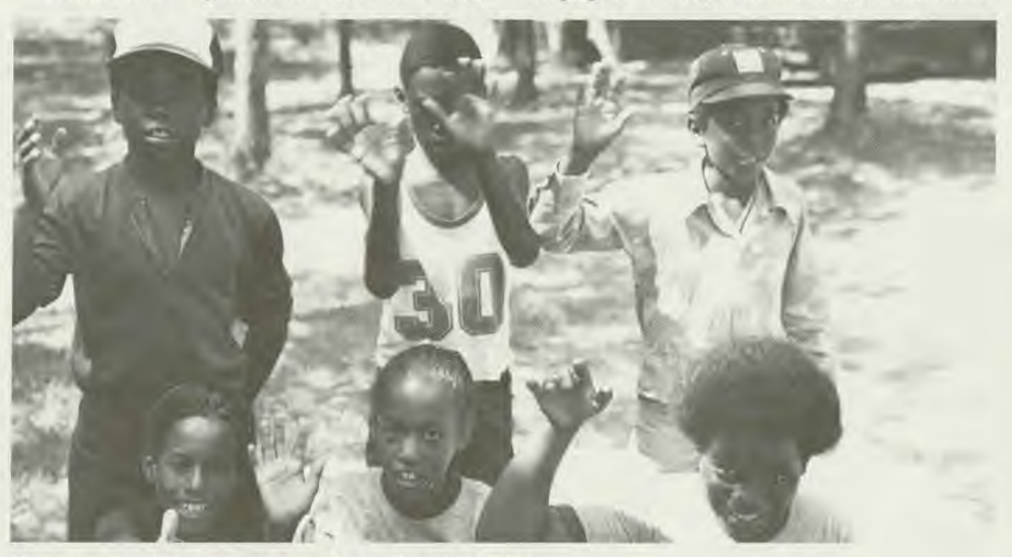
Opportunity Camp youngsters from Sapulpa, Okla.

Another unique feature was the "Go Carts" that were used for transportation. The week passed ever so quickly because every camper was busily engaged throughout the days activities.