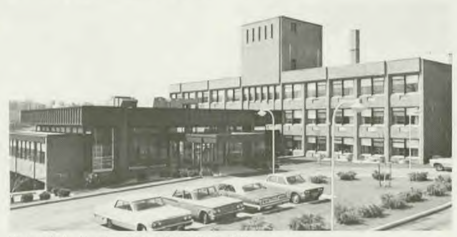
Victory Lake Nursing Home, Hyde Park, N.Y.