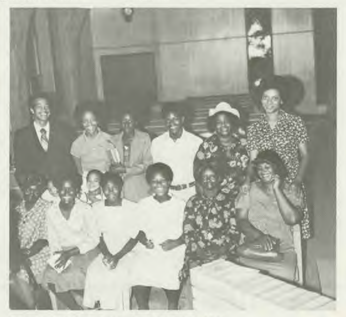
New congregation organized in Granada, Miss.