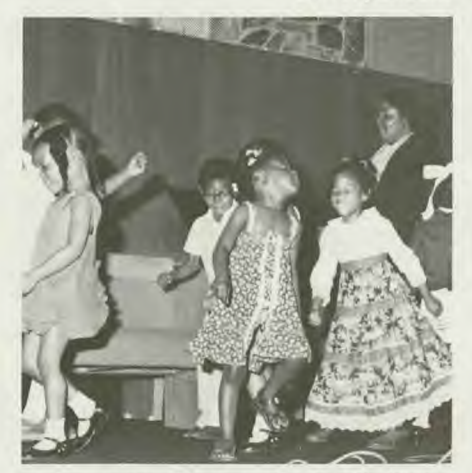
Action song: "Father Abraham" Kindergarten.