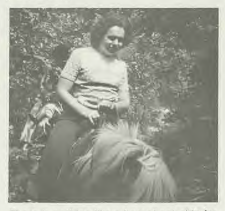
There is nothing like a horseback ride for the blind.