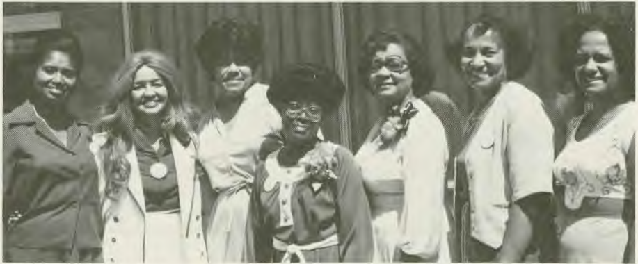
BAMDA Ladies Auxiliary.