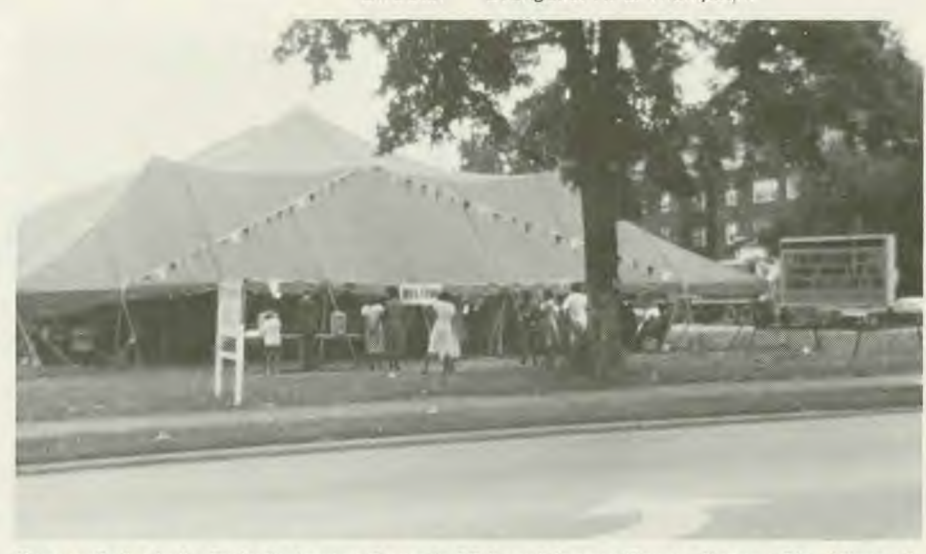
Canvas Cathedral-Today's Answer Crusade 35th and Armour/Paseo, Kansas City, Missouri.