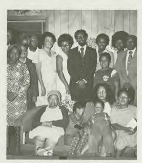
New congregation at Dechard, Tennessee.