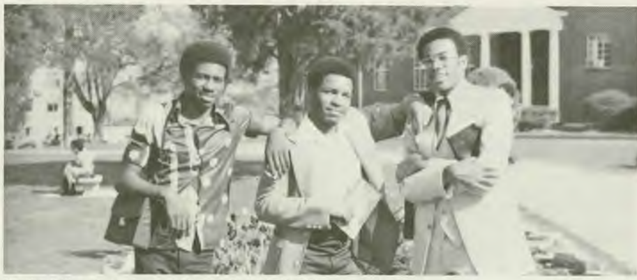
Student literature evangelists working in the Kansas City area.

The first day of Vacation Bible School found eighty-one in attendance and by Thursday of that week, there were one hundred and four present.