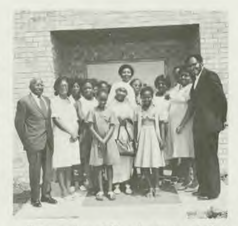
Congregation at Church opening at West Point,