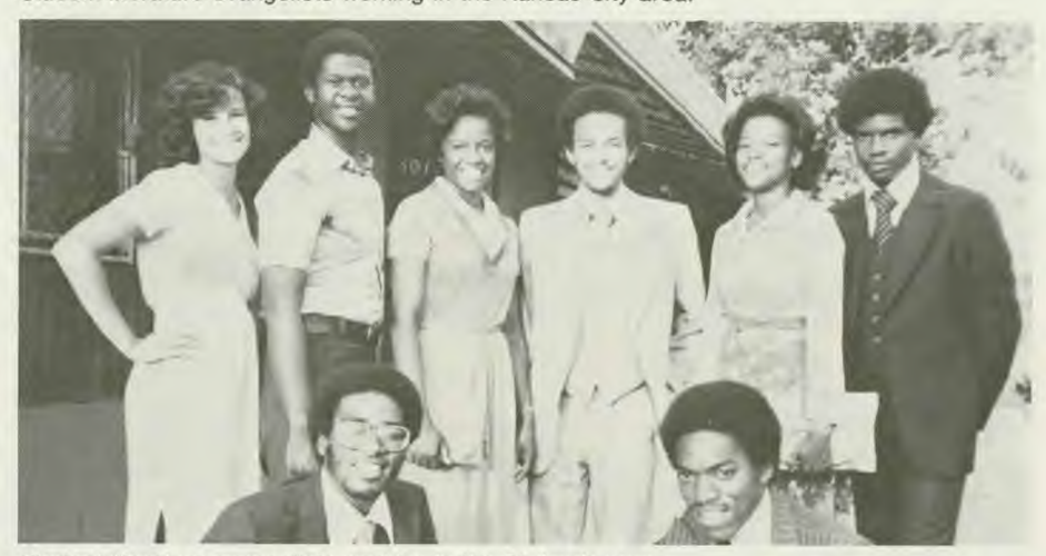
Student literature evangelists working in the St. Louis area.

The Junior Department had the highest enrollment of forty-one students, the Primary Department's enrollment was thirty-eight, and the Kindergarten Department's enrollment was twenty-five. All the departments had ninety-five percent of their enrolled students in attendance daily.