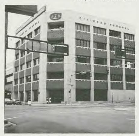
Citizens Federal Savings and Loan Association.