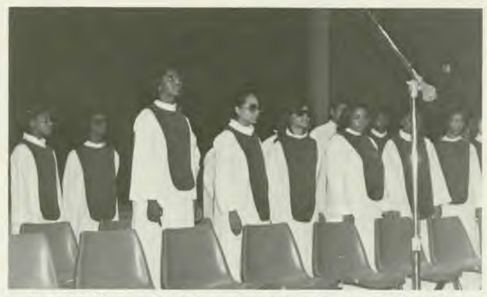
Straford Memorial Choir as they gave special music at the 11 a.m. service.