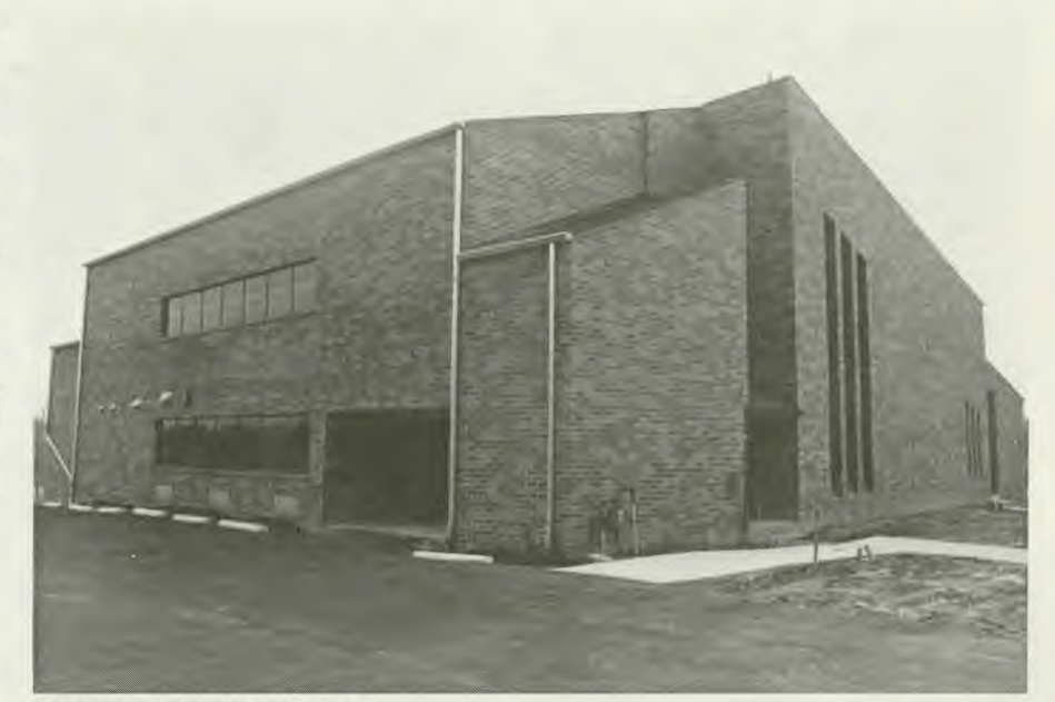
Rear view of Southeast Church.