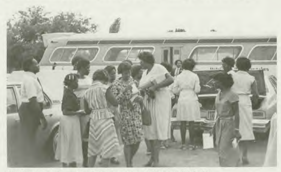
City Temple members return from the missionary literature distribution.