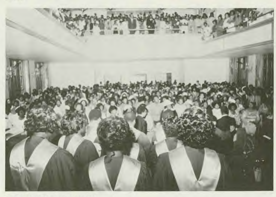
Audience at dedicatory services.