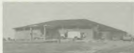
The completed structure of the New Heights SDA Church in Jackson, Mississippi.

In the meantime, the New Heights congregation found it necessary to hold services separately from Berean S.D.A. Church. In April, 1978, the congregation began holding services at Mount Moriah