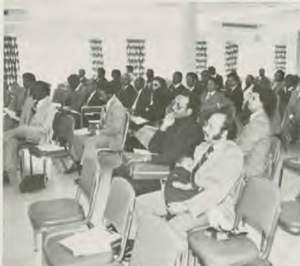
Ministers and Bible Instructors listen intently as new techniques are presented.