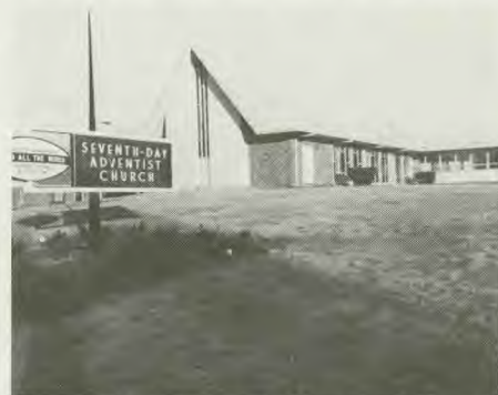
Bethany SDA Church in Macon, GA, built in 1966 by Elder Paul Monk; and dedicated by Elder Marvin Brown, the present pastor, on October 13, 1979.

In June, 1966, with funds from the old building, a rally, help from the South Atlantic Conference, the dedicated