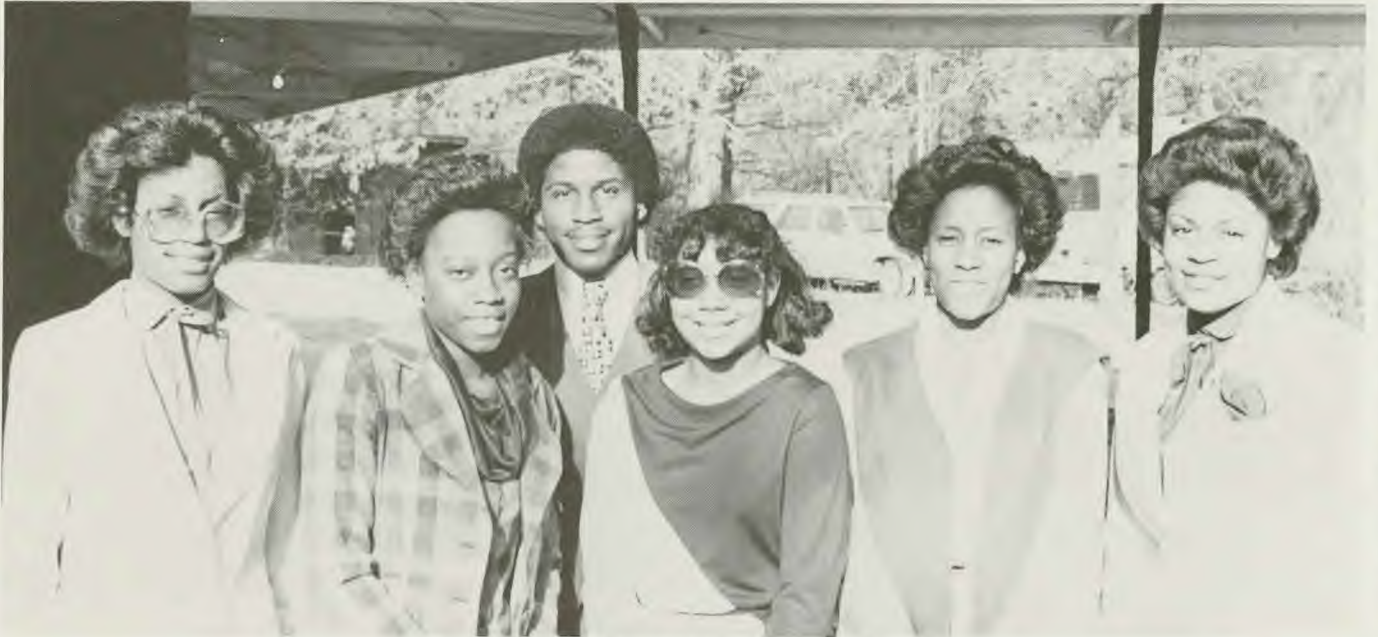
A group of youth who participated in the annual retreat.