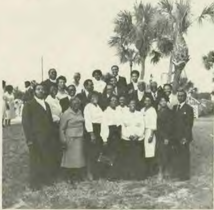
Literature evangelists from the South Central Conference.

Just as God had Peter and John prepared and equipped with a message of hope to the lame man at the temple gate, just as God called Elijah to bring a revival message of truth to apostate Israel, just as John the Baptist was sent to prepare the way for the first advent of Christ, even so, God has called the literature workers of this hour to place the gospel of Christ in every home through the printed page, preparing a people for the second return of Christ to this world.