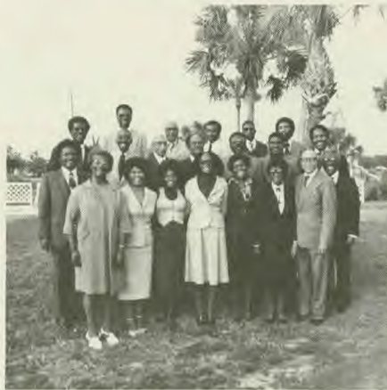
Lake Region Conference literature evangelists.

The Literature Evangelist for this day must be more than a walking, traveling, successful salesman. He must be willing to stand in the mid-stream of rival philosophies, and revolutionary ideas, and as the swift-flowing currents of chaotic thought sweeps around him, he must be able to lift his fellowman to safety, placing their feet on the Solid Rock—