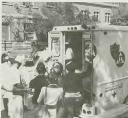
Community Services van readied for distribution of clothing.