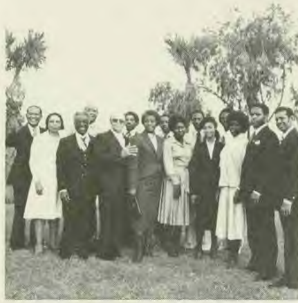
Oakwood College Literature Evangelists.

We must not build up big, expensive, plans and develop an atmosphere of enthusiasm while here, only to return home and be lulled into a spiritual stupor by the enemy. We need to reassess our emphasis, make certain that it harmonizes with the divine counsel given us in the blueprint for these closing scenes. We must reexamine the terminology we are using, to see whether the message we