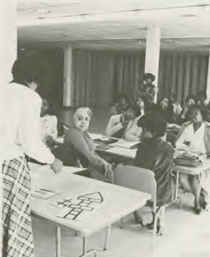
The teachers of Lake Region as they participate in a workshop.