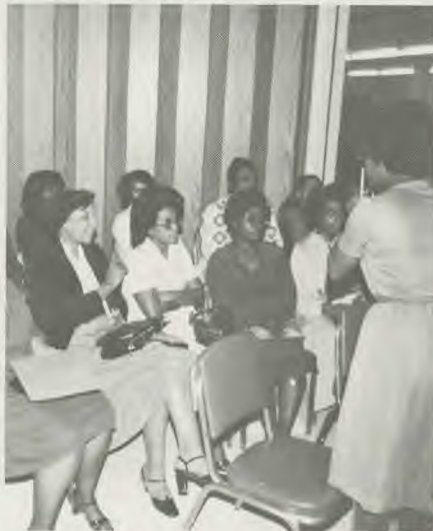
The Shepherdess Club making plans for the coming year.