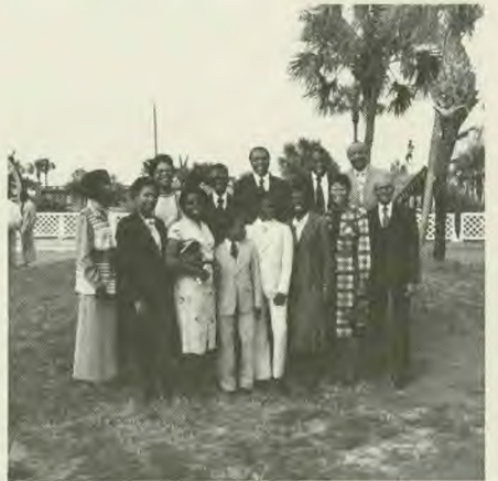
Northeastern Conference literature evangelists.