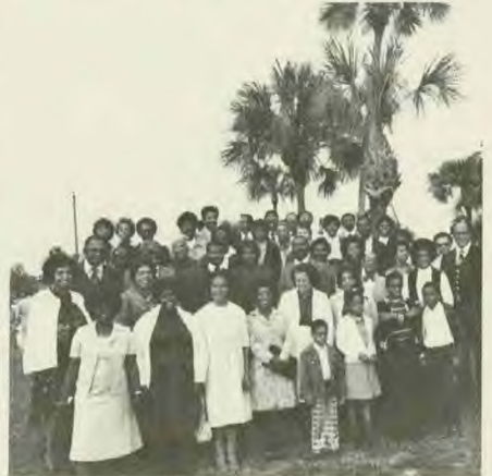
Allegheny East literature evangelists.

For this God-given task, the church needs God possessed men and women, who if they would make full proof of their ministry must do the work of a literature evangelist. We cannot escape our God entrusted responsibility in this work. We must address ourselves to the mandated task of God and to that task alone. Let us therefore use every energy to meet this challenge. Let us meet it with discernment, with awareness, and with power. Let us detach ourselves from every other entanglement. Let us have no other commitment. Let us recapture the divine impulse of the early church and go forth declaring the unsearchable riches of Christ, saying silver and gold have I none, but such as I have give I thee. In the name of Jesus Christ of Nazareth, rise up and walk.