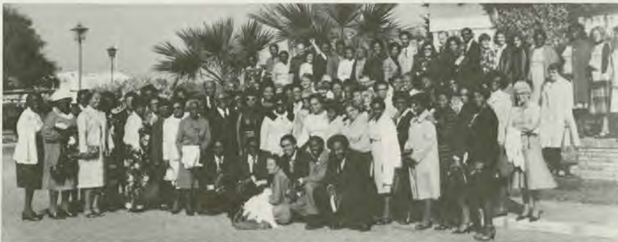
Pictured are South Atlantic, South Central and Kentucky-Tennessee Conference teachers and guests on Sabbath at the Holiday Inn, Malaga, Spain.