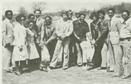
Ground breaking ceremony for New Heights SDA Church in Jackson, Mississippi.

The pastor and members have accepted the challenge of baptizing at least 200 souls in 1980.