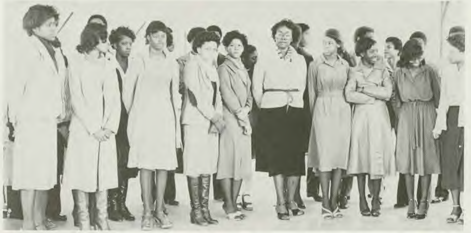
A group of youth at the annual retreat stands ready to accept the command.