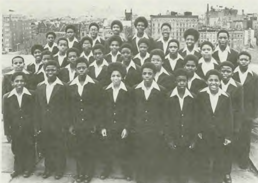
The Boys Choir of Harlem.

black musicians written especially for the BCH. The choir performs numbers in French, Latin, German and an African dialect.