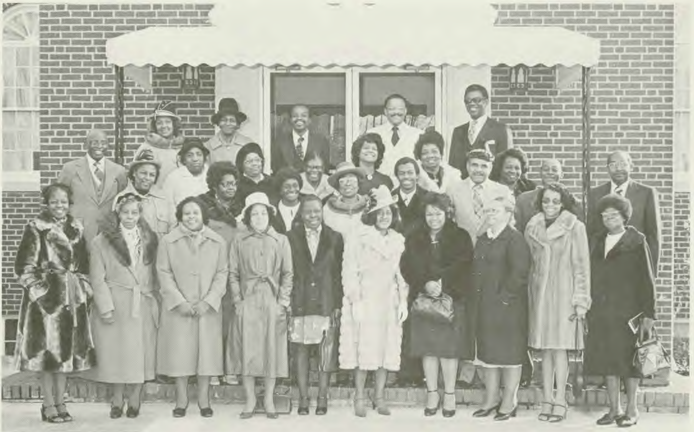
Pictured are 43 centurions who raised $100 or more during Ingathering.