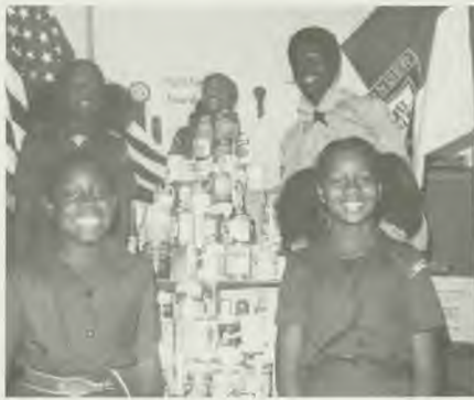
Denver Pathfinder Club.