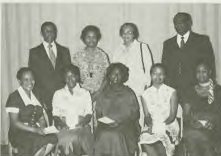
East Knoxville's new congregation.