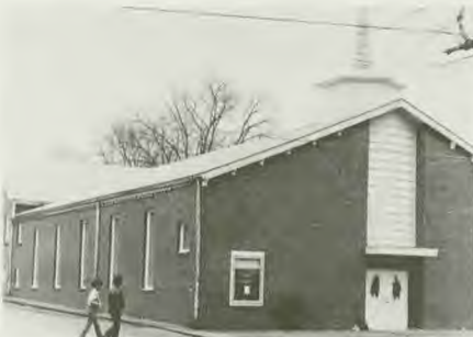
Worship Place at Hopkinsville, Kentucky.