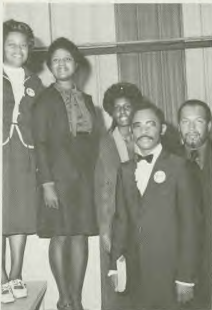
Christ Is The Answer Crusade Team.