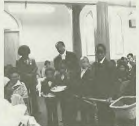
Juniors in training take up offering at Lighthouse Tabernacle in Brooklyn.