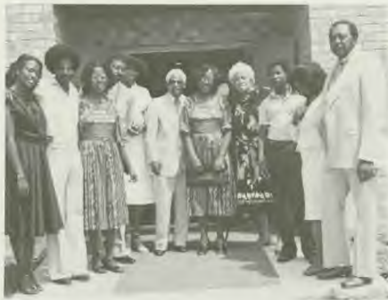
Some of the descendants of the Lee family and their friends return for church opening at West Point, Mississippi.