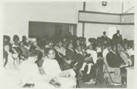
Jackson, Mississippi church opening services audience overwhelming.