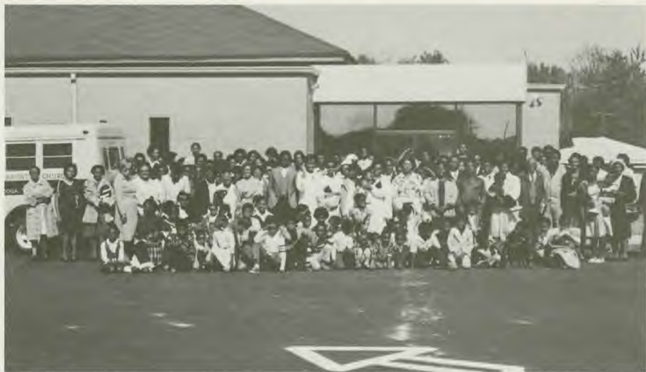
The members of Chattanooga celebrate at the opening of their new church building.

of planning and working, this project became a reality and the members moved into their new church building in October 1979.