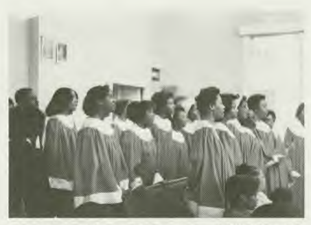
Lighthouse Youth Choir sings "Will You Be Ready."

still thriving," The message based on Deut. 31:1-6, he entitled "Facing the Future with God." (There's a difference in facing it without Him.)