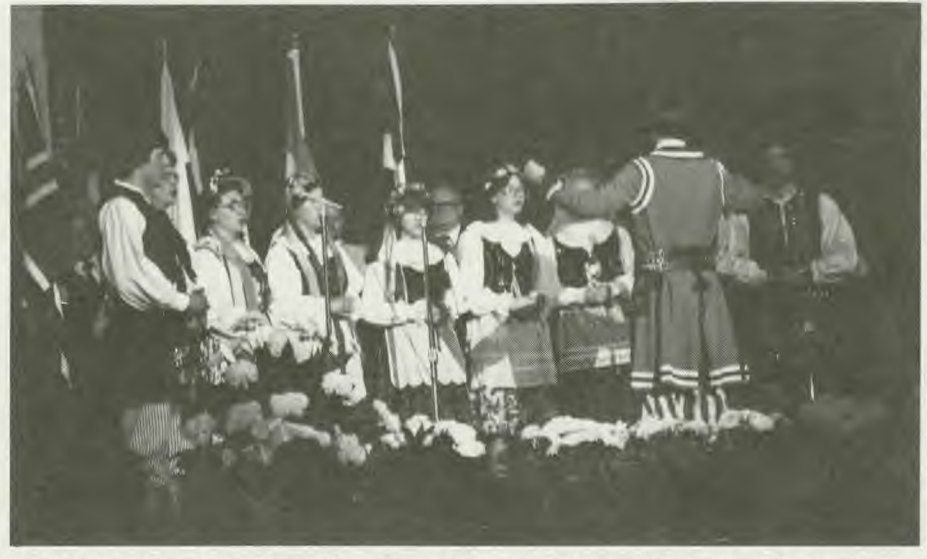
Youthful Choir from Poland sings the songs of Zion and of their land during the G.C. Session.