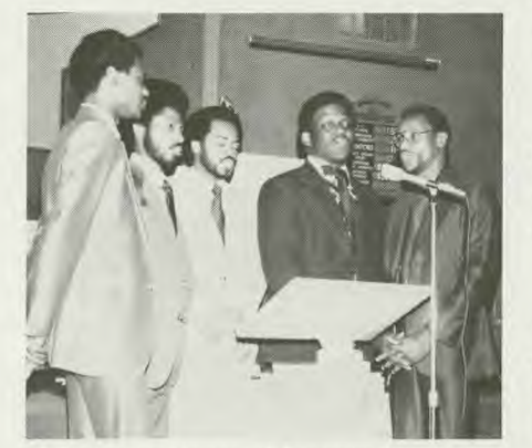
Male group "Voices of Supreme" presented music at Sabbath School and Youth Hour.