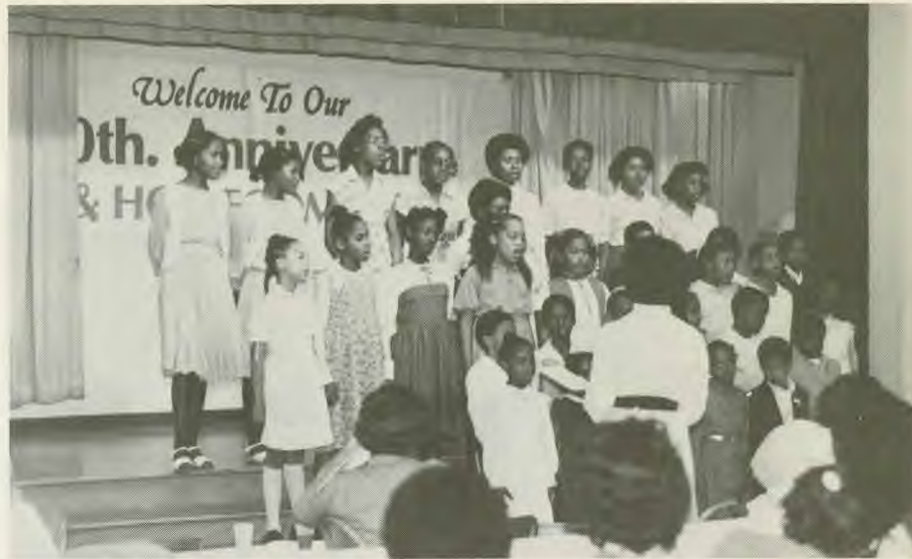
Singing group of the Emma L. Minnis School at the library dedication.