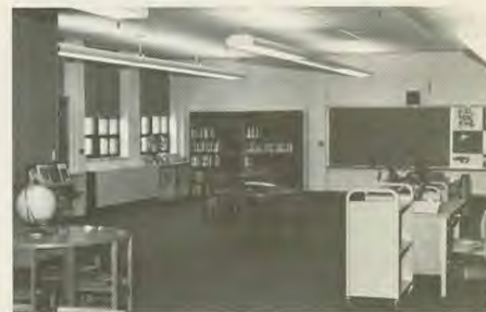
Library of the Emma L. Minnis Elementary School, Louisville, Kentucky.