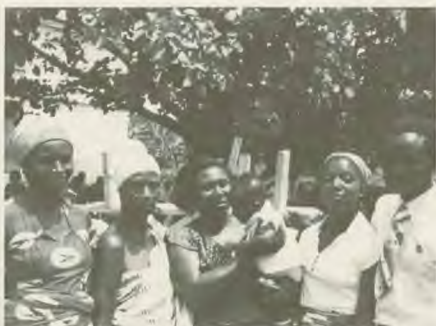
Entire families, such as the one pictured here joined the church after the crusade.

"After the second night we were like twins," commented Elder Connor. "He used the same voice inflection and gestures I used. I didn't need to slow down at all. Each day we discussed the vocabulary I planned to use that evening, in order to be certain there were words with similar meaning in Twi."