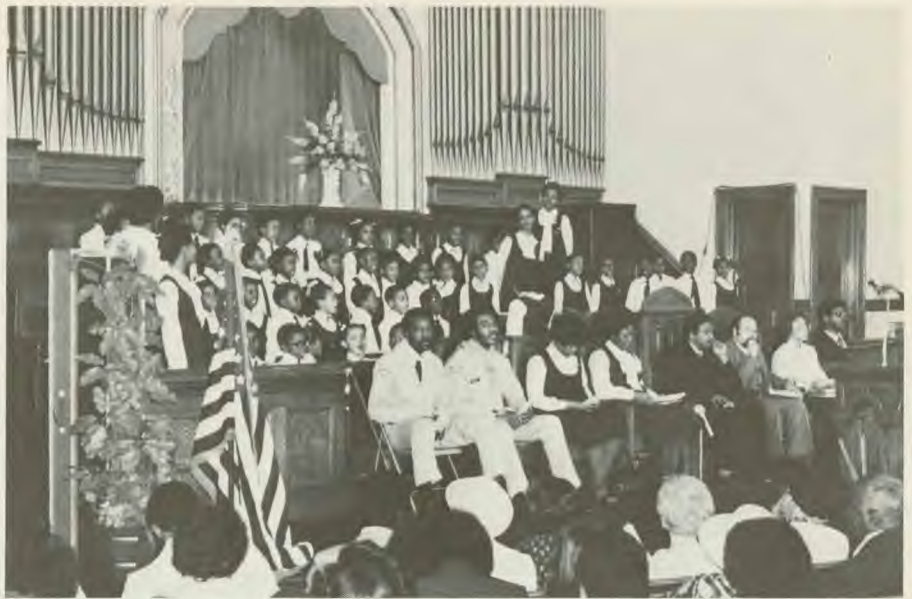
Busy Bees participating on Children's day.