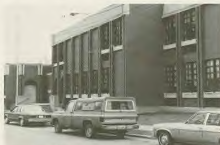
Emma L. Minnis Elementary School, Louisville, Kentucky.