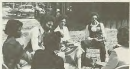
Sabbath morning communication exercise.

The dilemma of the single black Seventh-day Adventist torn between going outside the church to find a mate or excusing their singleness as the will of God has become a major concern.