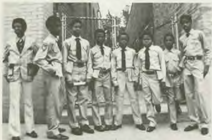
The Guys (Younger Club Members).