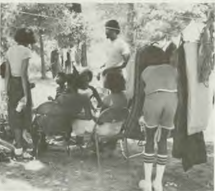
Campers in group discussion.