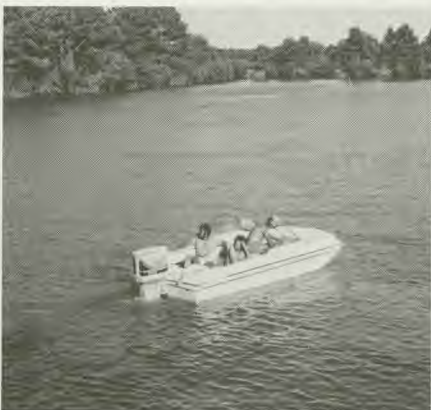
Campers enjoying a boat ride.