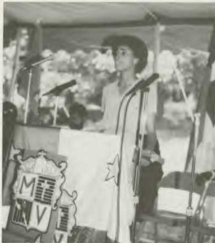
One of the many participants at camporee.

The youth pavilion was located across from the camp store and was colorfully decorated in gold, red and green with matching pot plants. The distinctively colored flags served as a backdrop and