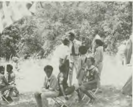
Pathfinder director counseling with campers.