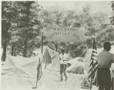
Pathfinders' tents at Conference Camporee.