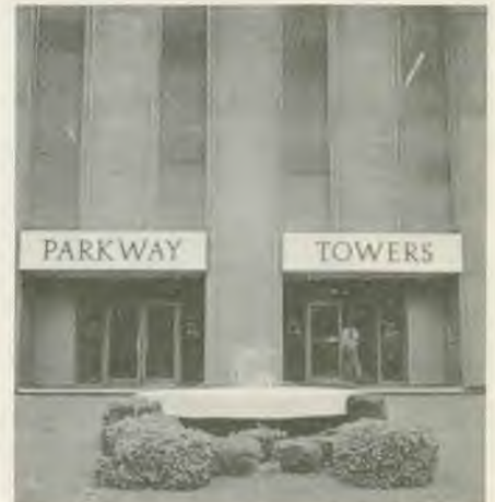
The ARMA offices are located in the heart of downtown Nashville, Tennessee.

ARMA offers comprehensive "on-site" property management and maintenance services. Their professional and support personnel are highly trained to meet the diversified requirements of their clients.