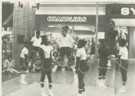
The Starlite Tumbling Team performs at an Indianapolis shopping center mall.