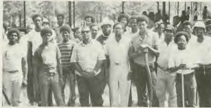
The elders and deacons hiked over the Lone Star Camp Sabbath afternoon for recreation and felt refreshed.