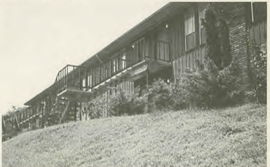
Arma-managed apartment complex.