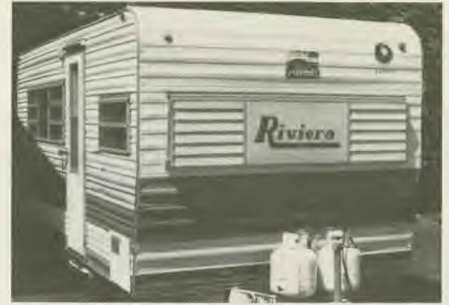
The 1972 Riviera travel trailer donated to the Central State Conference.