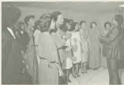
The Chapelaires from the Maranatha church were among those providing music.