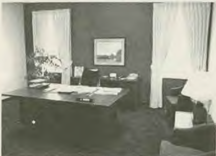
A departmental director's office.