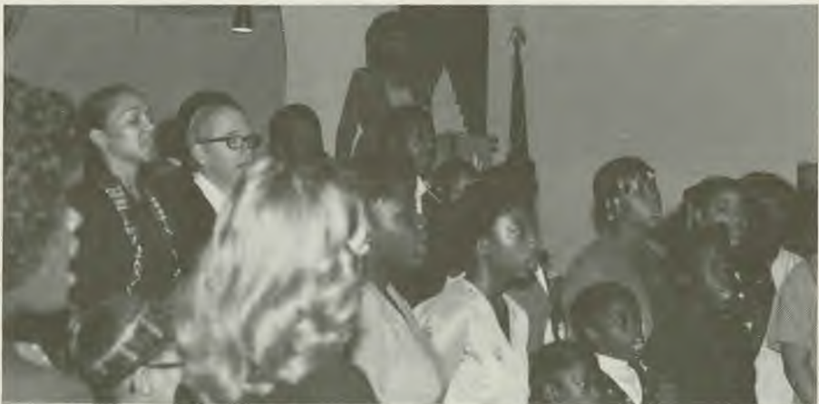
Adventist Youth Federation Choir.

Youth federations are a very important part of youth ministry activities for the Central States Conference. We are challenging the youth leaders of these federations to make 1981 a banner year for spiritual growth and personal evangelism.