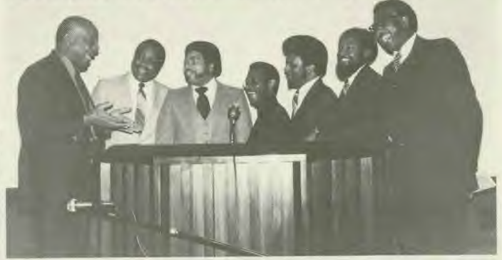
E. E. Cleveland discusses plans for 1981 evangelism in America with top evangelists who baptized almost 2,000 during 1980.