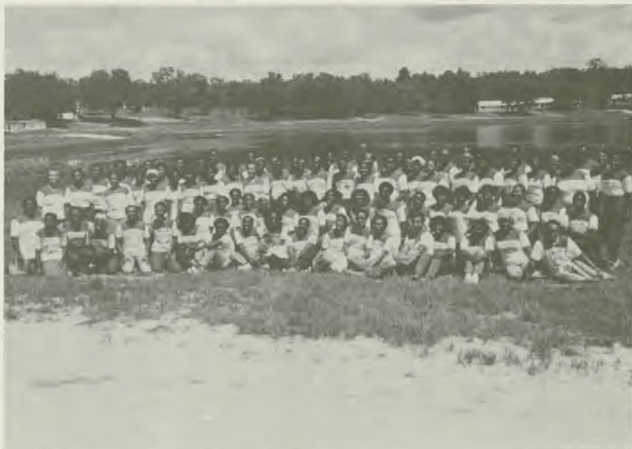
Senior youth campers, 1980, in their T-shirts.