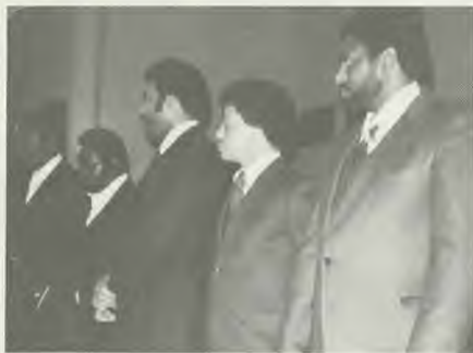
Participants during the special Sabbath services held at Bethel church.