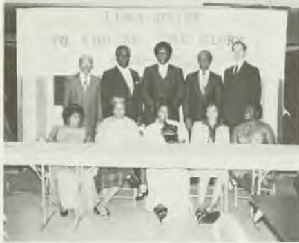
Lexington, Kentucky, mortgage burning.