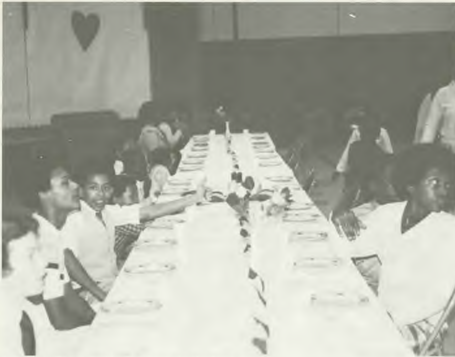
Summit Climbers Pathfinders enjoying the banquet.

In addition to the award presentations, there were more songs and poems. Among the highlights of the evening were the songs presented by the French church. They sang several songs in French, including an arrangement of "Love Lifted Me."