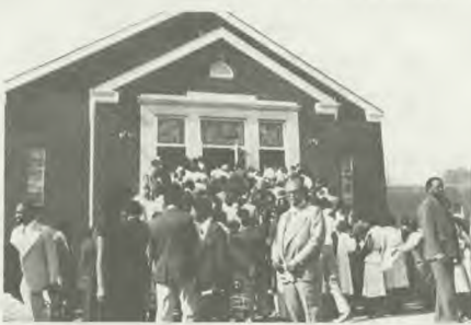
South Park congregation after Sabbath worship.