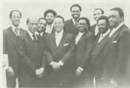
Natchez, Mississippi, church dedication.