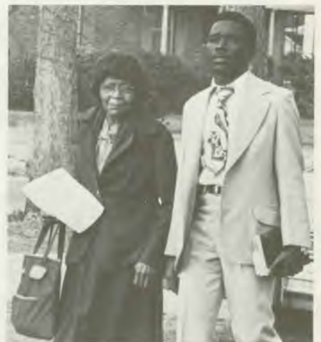
Church members witnessing for God.

Amazingly, the immediate result of the seminars is a new sense of mission among the laity. Having understood the ministry of the Holy Spirit in dispensing gifts to each one, the member now has a sense of self-esteem and competence. He now feels that God is with him, all fears are gone!!! A permanent new lifestyle of witnessing for Christ is followed. Heaven only knows what the results will be as hundreds, even thousands of stars begin shining and turning many to righteousness.