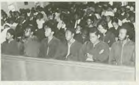
Baptismal candidates await baptism, having been converted by the "Christ Is the Answer Crusade" team.

God blesses those who obey Him; happy the man who trusts in the Lord. Proverbs 16:20