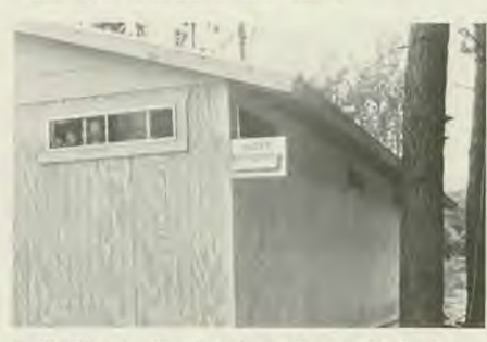
L. Battles built a lovely restroom for ladies and men at Camp Lone Star.