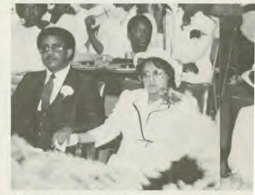
Candidates listen to sermon.