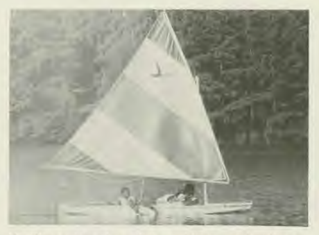
Youth enjoyed sailing, skiing and other water sports at Lone Star Camp.