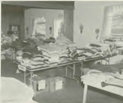
One of the dispensing stations.