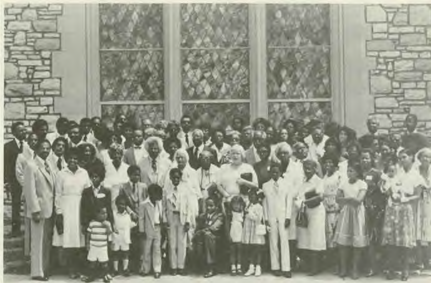
Pictured are members of the families at the Reid-Davis family reunion held in St. Louis, Missouri, in July.