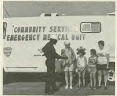
The director interviews a family that had lost everything and seen two neighbors killed.