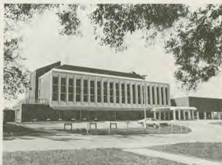
The present Riverside building is modern in design and occupies a prominent spot at the bend of the Cumberland River in North Nashville.