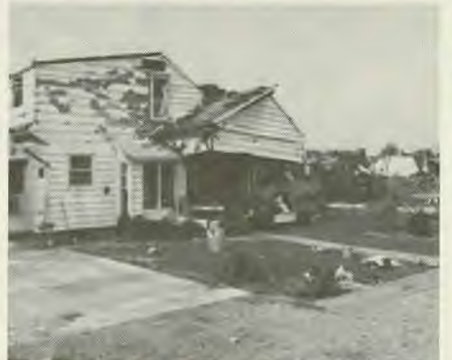
A portion of the devastated area.