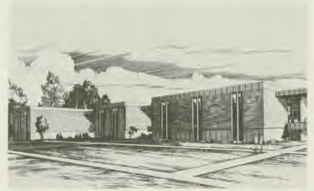
Oakwood College's new science complex.