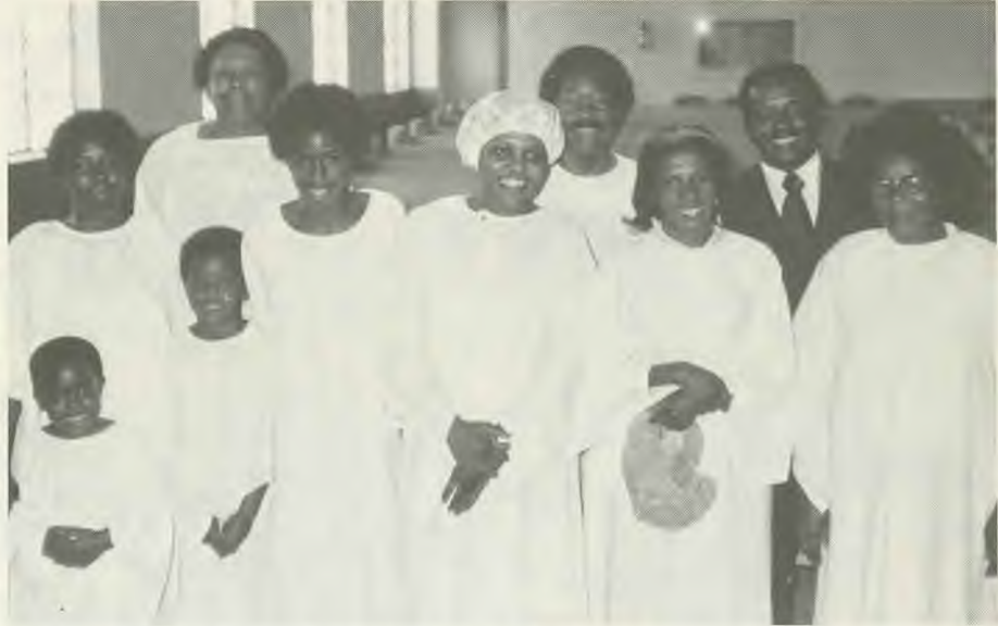
New group keeps the Sabbath in Hobbs, New Mexico.