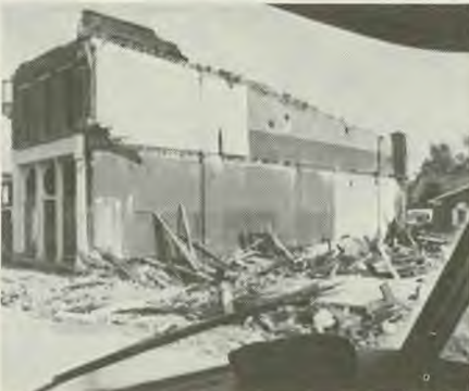
Scenes depicting the devastated areas.