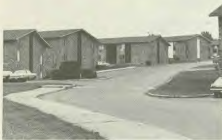
Haynes Gardens Apartments