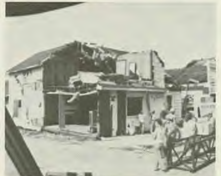
In the path of the tornado.