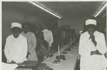
The love feast and communion services.