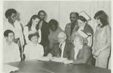
Pharmacy committee members.

Therefore, in planning for the future our focus has been of necessity on strengthening, not expanding services.