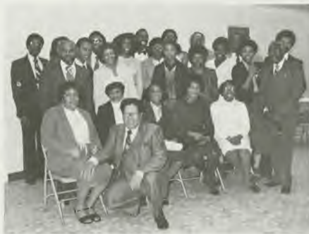
Central States literature evangelists.