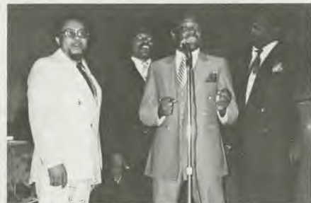
A quartet of singers during the Sabbath afternoon services.