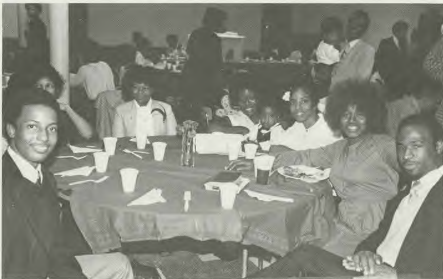
The FLEET rally congregation awaits a prepared lunch.