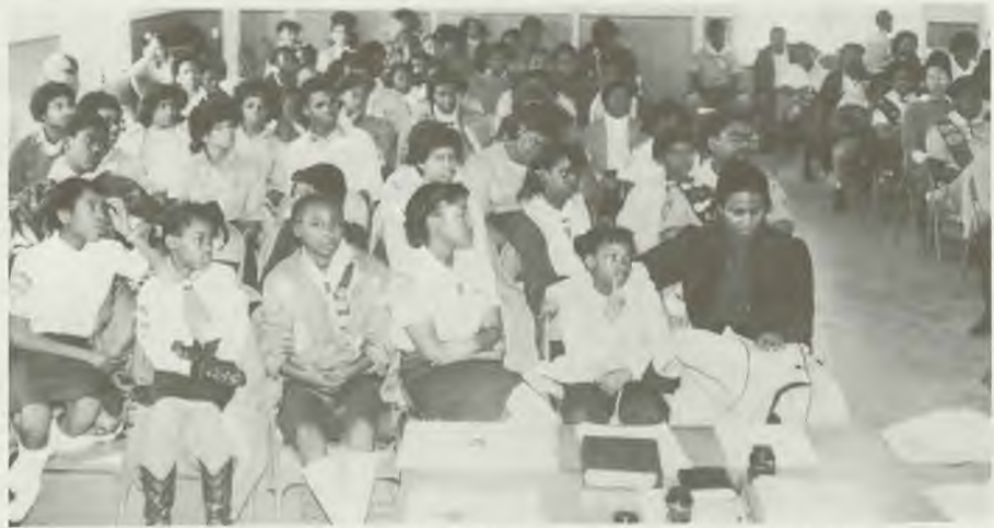
Campers listen attentively during the honor class period for rocks, minerals, camperaft and sands