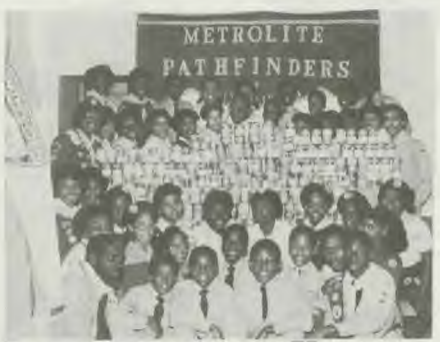
Cans collected by the Metrolite Pathfinders.