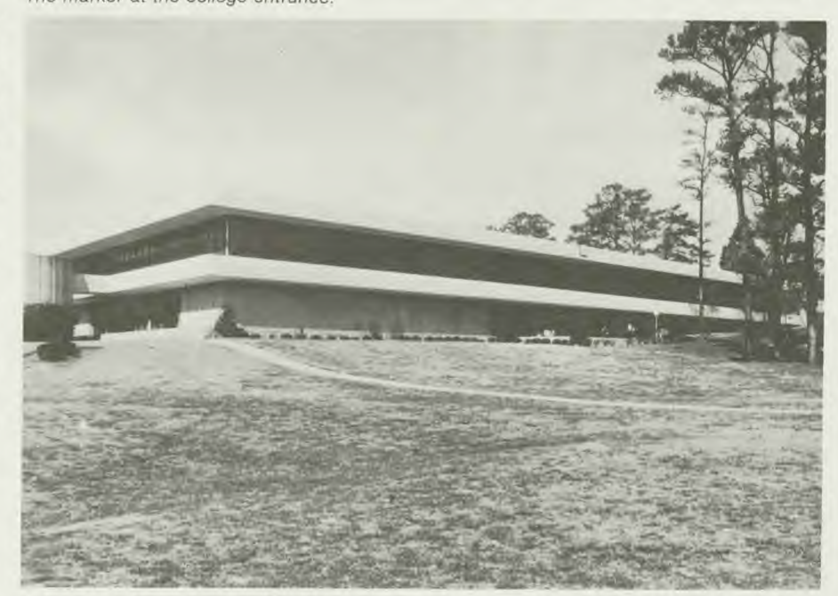
The administration building (Blake Center).