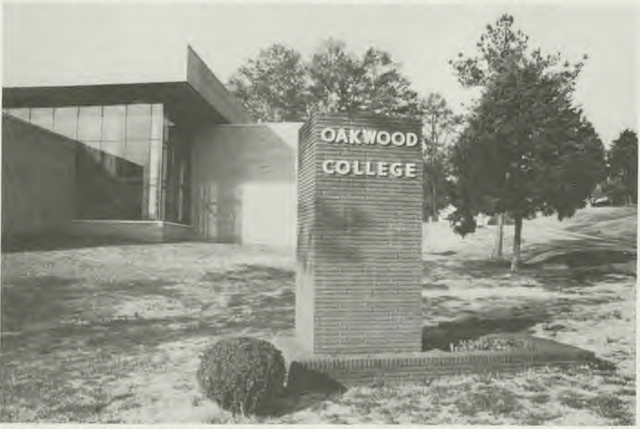
The marker at the college entrance.

teachers are assisting students in their transportation to Oakwood. Remember the dates: April 25 and 26.