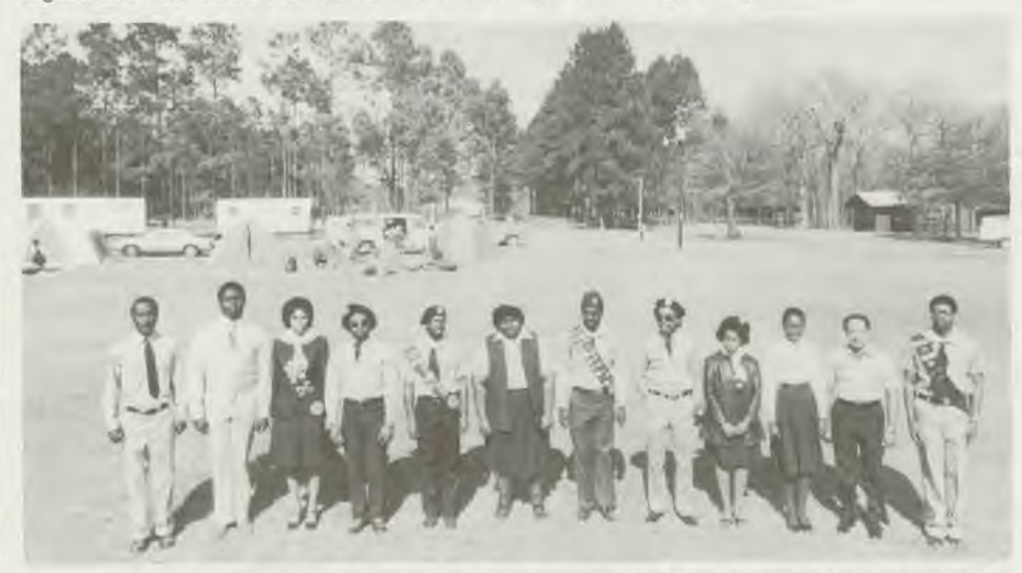
Directors and deputy directors attend winter camp at Lone Star to complete the Pathfinder staff training course.