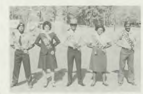
Master Guides attend winter camp at Lone Star, January 28-30.