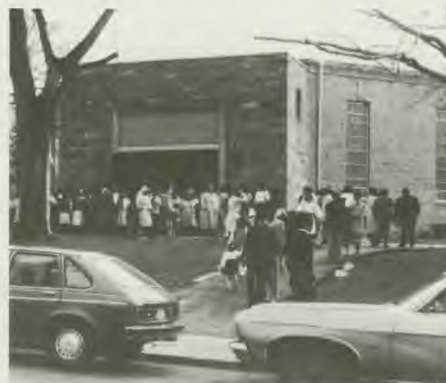
A crowd gathers in front of the new Church of the Oranges for opening day ceremonies.