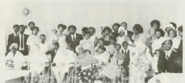
Nursing home patients and visiting friends.