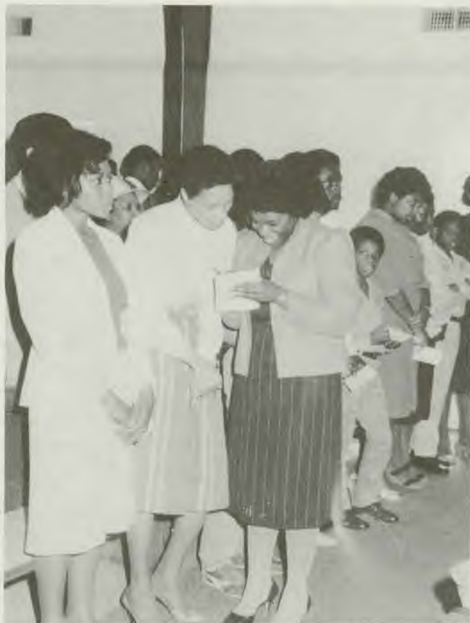
Seven visitors join the church following the president's message.