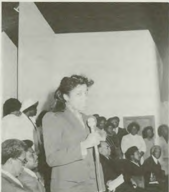
A youth choir of 35 voices presented music for this special Sabbath.