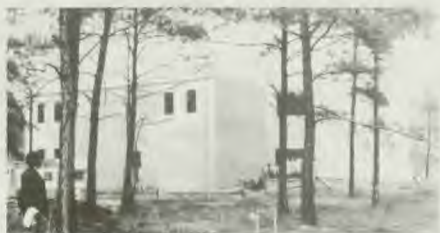
The new church/school building in Hattiesburg, Mississippi.