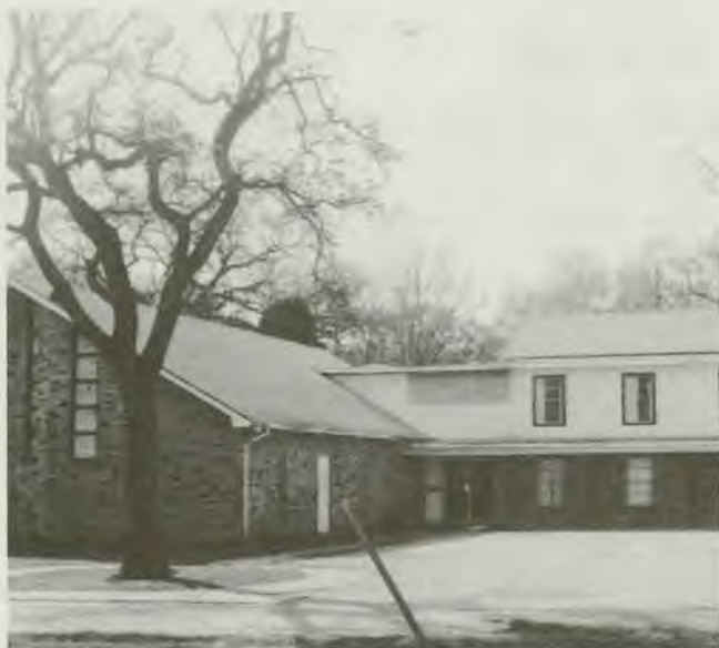
The Sheffield SDA Church in Houston, Texas.