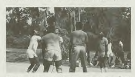
The South Atlantic Conference pastors took on the Southeastern Conference pastors in a basketball showdown.