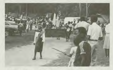
The color guard and drum corps made a spectacular showing on Sabbath afternoon.