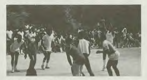
South Atlantic Conference pastors battling Southeastern Conference pastors in a basketball game.