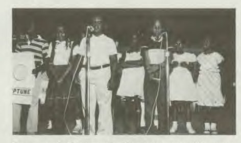
Boys and girls sharing the songs and lessons taught at Sabbath school.