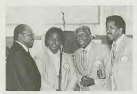
The Remnants, a prison ministry quartet from Washington, D.C.