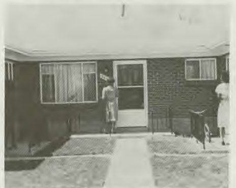
Park Hill members in action.