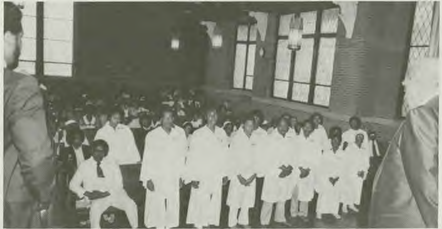
Baptismal candidates of the Prophecy '83 Crusade.