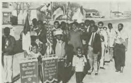
Participants at the winter camp held at Lone Star Camp.