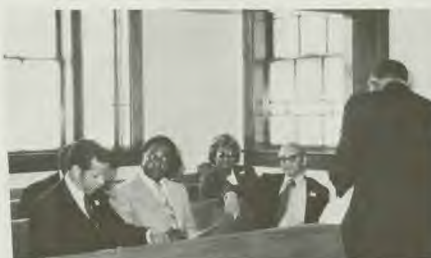
Officers of the East Tennessee small church evangelism rally in a planning session for the next meeting, to be held in Cleveland, Tennessee.

At one of the meetings in Morristown, Tennessee, there was standing room only. This church only has five or six members. The pastor looks for the membership to triple in 1984.