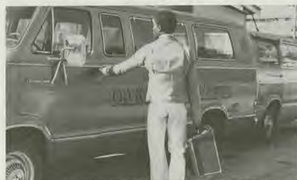
An Oakwood literature evangelist student preparing to drive one of the L.E.T.C. vans.

It is estimated that more than a million people have been contacted through the L.E.T.C. program. There is no way of knowing exactly how many have been saved as a result, but what we do know is that this work is vital and necessary. A current goal of the L.E.T.C. program is to contact 500,000 people during their spring 1984 campaign.