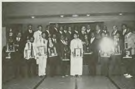
The literature evangelists responsible for $128,692 in deliveries with General Conference and regional conference personnel.