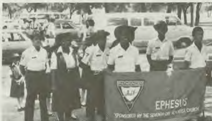
The Alamo City Rangers, the Pathfinder club of the Ephesus church in San Antonio, Texas.