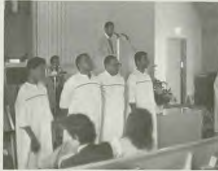
Candidates for baptism.

Many souls have come to Christ through baptism, rebaptism and rededication. Through a series of studies from the book "Preparation for the Final Crisis" during the Wednesday night prayer service, church members were made more aware of the soon coming of our Lord and Savior, Jesus Christ.