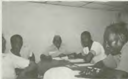
Local elders during a planning session for Earth's Last Warning Crusade.