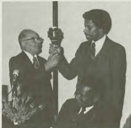
Passing the torch to a new generation.