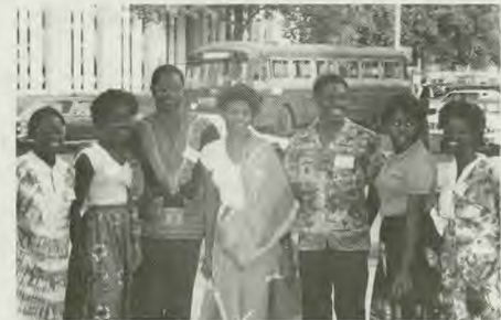
A few of Oakwood's international students.

Huntsville-Madison County also caters to the needs of the foreign student by providing such programs as language banks, host/family programs and tours. The council for international visitors sponsors an annual reception for foreign students who attend colleges and universities in the Huntsville area.