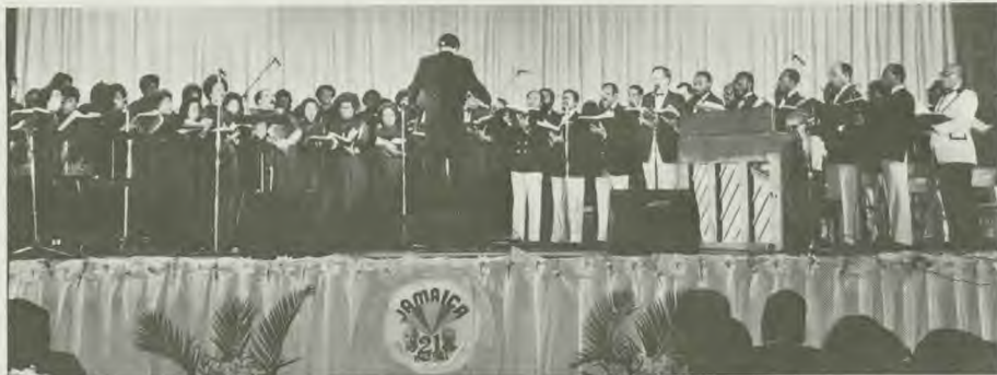
The Cantata Choir of New York City performing at the National Arena in Kingston.

In commemoration of Jamaica's 21st independence anniversary, the government hosted a year-long celebration. The 100-voice Cantata Choir of New