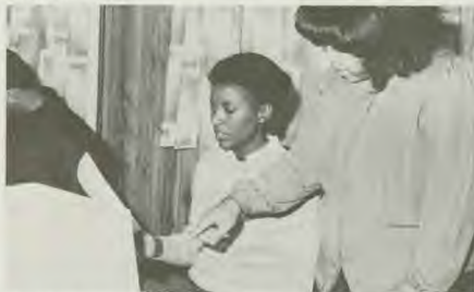
A student assisting another in a computer literacy class.

The method of success begins and continues with adequate preparation. The faculty and staff at Oakwood College are eagerly and ably equipped to meet this challenge in the educating of our youth.