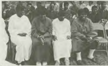
Candidates await baptism at the House of Correction in Philadelphia. In the last row are SDA members from northern New Jersey.

Some of the men were transported by prison staff from other institutions (Holmesburg and Detention Center) to