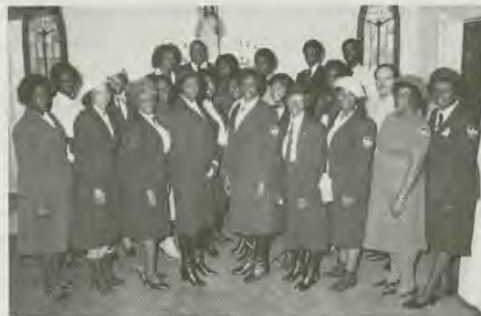
Members of the community services department of the Beacon of Joy church in Chicago, Illinois.

A touch of friendship is demonstrated when time is taken to make sure the senior citizens have taken their prescribed medication or ensure that they are taken to the clinic or doctor for monthly visits. Many hours are spent reading the Bible and praying for senior citizens in their homes.