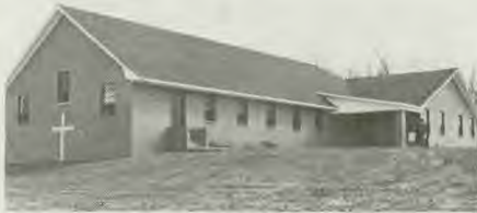
The Americus church opened February 18, 1984.