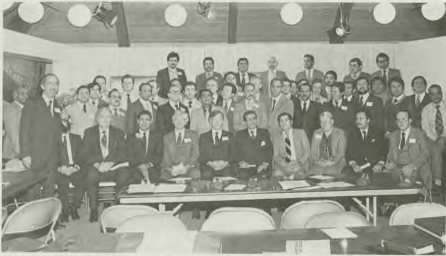
Forty-four pastors from eleven northeastern states gathered in New York for the first one-week intensive seminar leading to a master's degree in pastoral ministry.