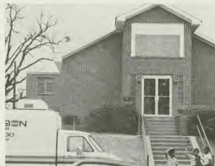
The Philadelphia church in Shreveport, Louisiana.

The ministers and churches cooperated beautifully for this large harvest of souls. We rejoice over the outpouring of the Holy Spirit.