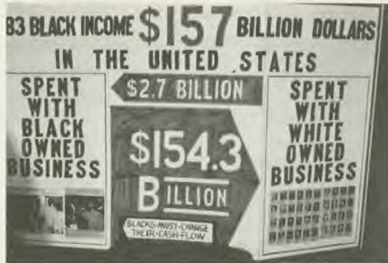
One of the many exhibits at the assembly.

Other discussions and workshops dealt with economics, family life, politics, employment and education. This was the first of such meetings that are to be held among black religious leaders.