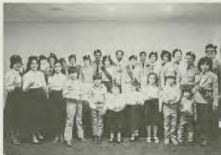
Members of the Central Spanish Pathfinders Club.