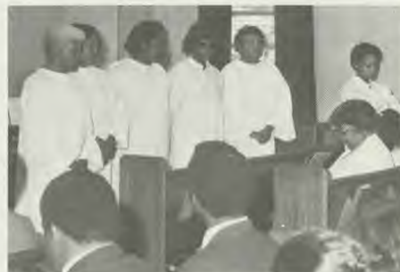
Candidates stand for their pre-baptismal examination.