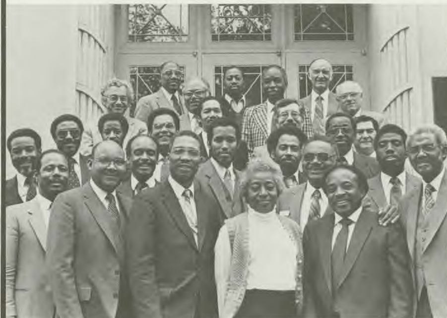
Inner-city and prison ministries directors who attended the workshop at the General Conference on May 16.