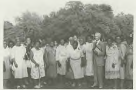
Classes were taught in nutrition, sewing and CPR. Twenty pioneers were honored for their faithfulness in developing the conference.