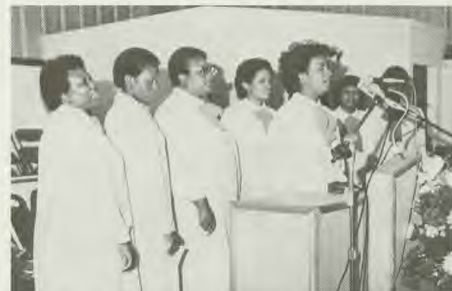
The Sounds of Joy.