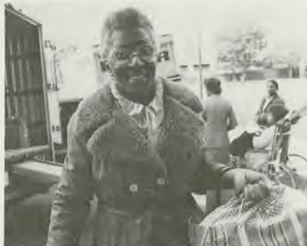
Smiles were in order as a tenant moved into the Towers.