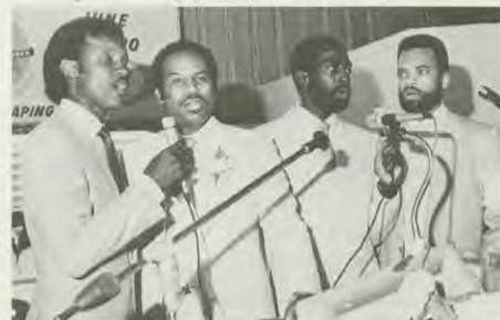
Breath of Life.