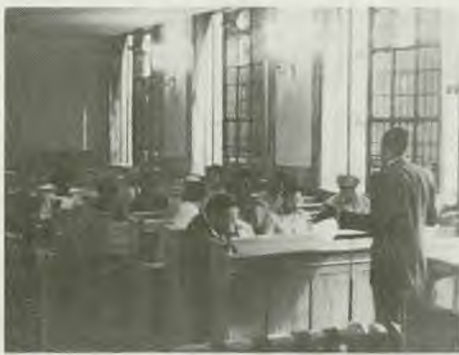
Members of the City Tabernacle adult division Sunday School.