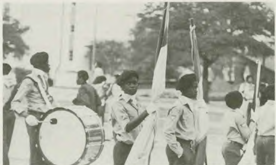
The Pathfinders parade through the streets in Houston during the United Youth Federation Meeting.