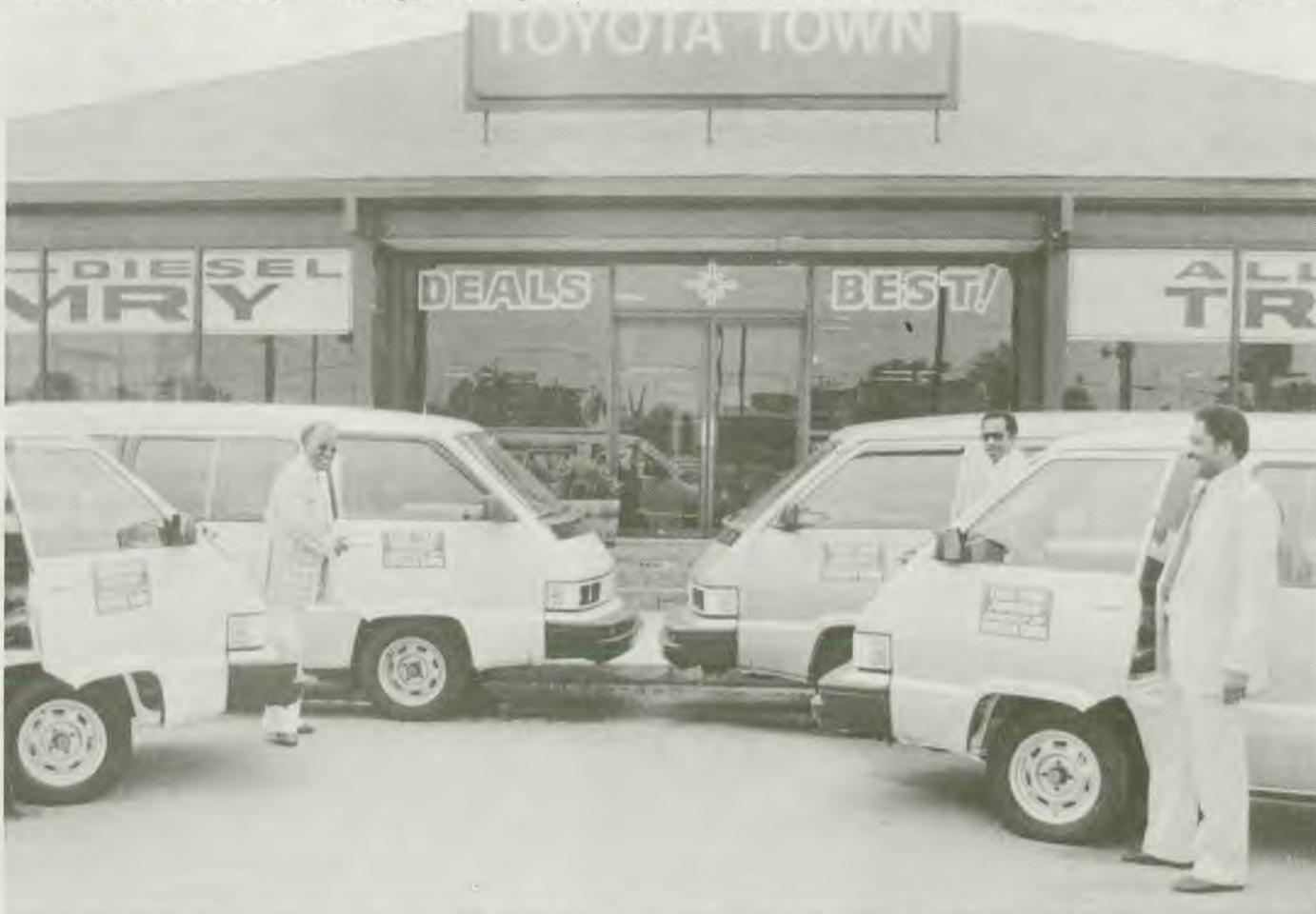
Oakwood received four 1985 seven-passenger vans from Toyota Town in accordance with an agreement which allows Toyota to build an access road on Oakwood's property.

Instructors receiving excellent ratings (900+ on a scale of 1,000) are: Gracie Monroe (Mathematics), Ronald Campbell (Business and Information Systems),