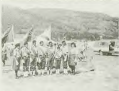
The Ebenezer Tigers, pathfinders club of Gadsden, Alabama.