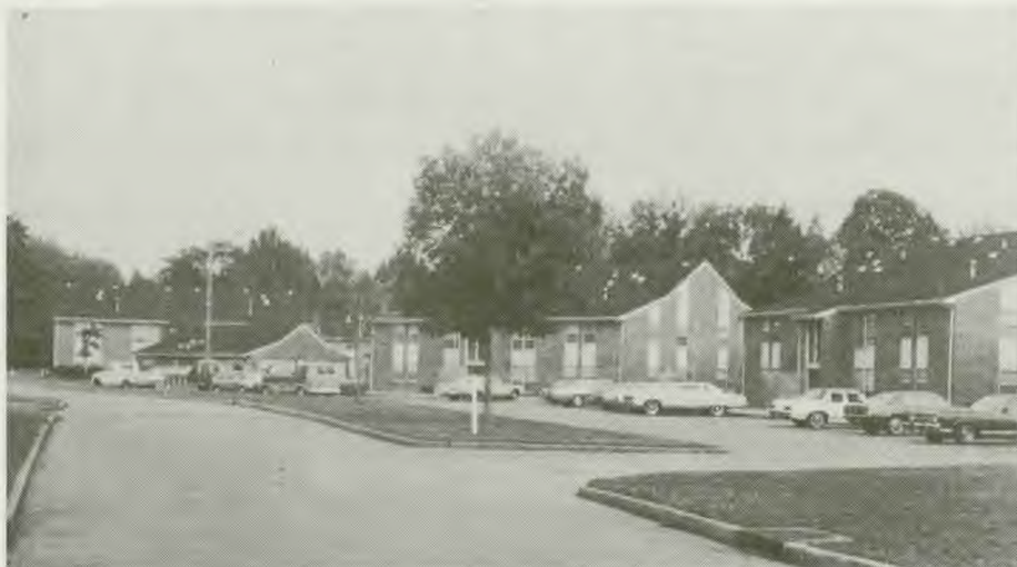
Dudley Courts, Paducah, Kentucky.