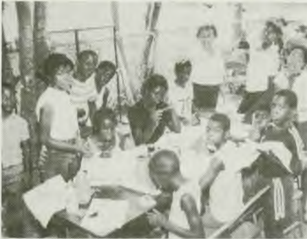
Neighborhood children involved in summer programs held in Jacksonville, Florida.