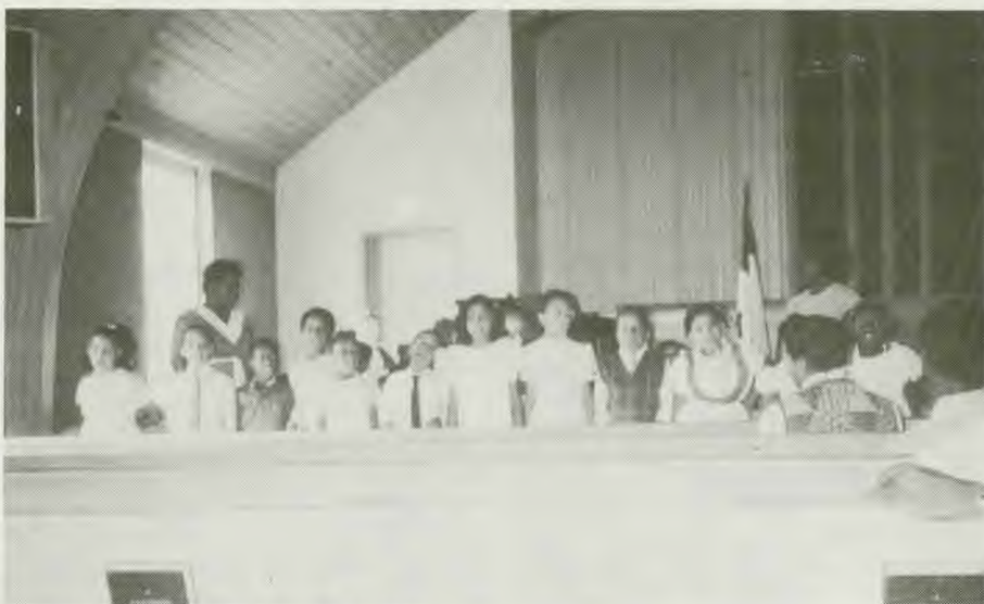
VBS graduates present afternoon program.