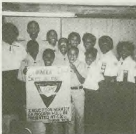
College Avenue Pathfinders.