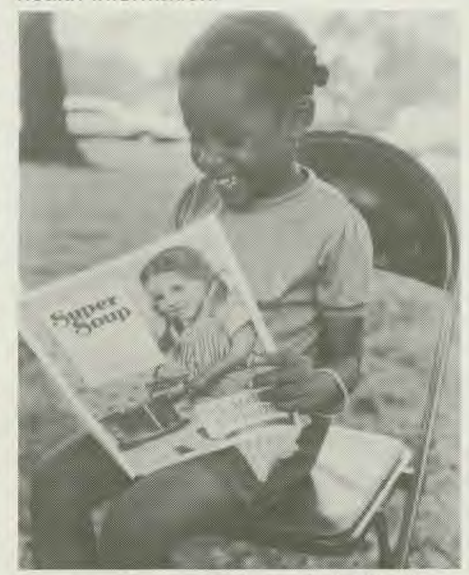
A young girl enjoys reading a Little Friend given to her at the Ossining Fair.

Over 500 pieces of literature, 300 Cosmic Conflicts, New Testament, Bible Answers and Happiness Digest were given away. Also, the fair goers received health information.