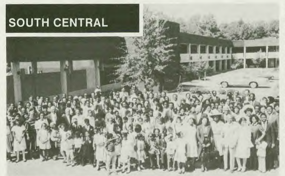
Workers and family members in attendance during the annual fall retreat.