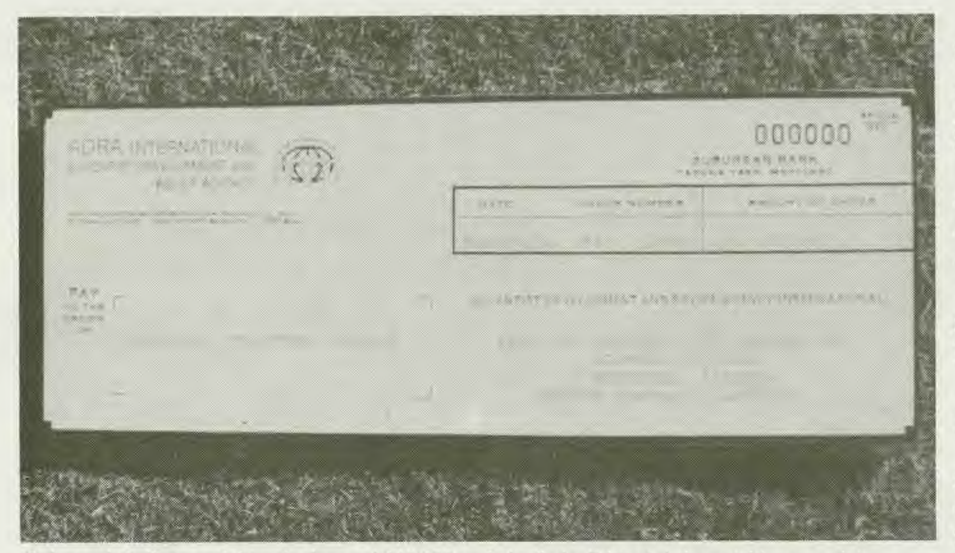
Oakwood College and friends donated $10,000 to help (help Ethiopia's languishing people).