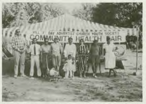
Youth Society members, church members and friends who participated in the Fair, shown after tent was re-erected.