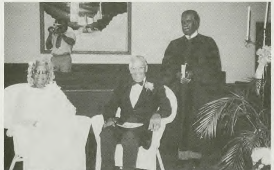
D.B. Reids celebrate 50th Anniversary.