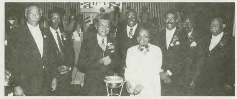
Mortgage Burning Ceremony at Amityville, N.Y. church.