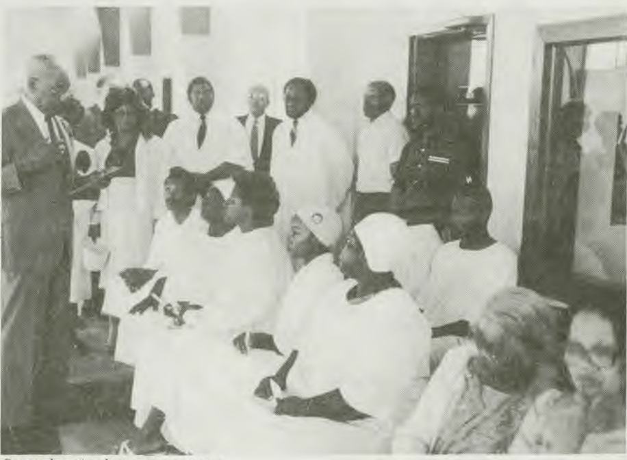
Seven baptized at campmeeting.