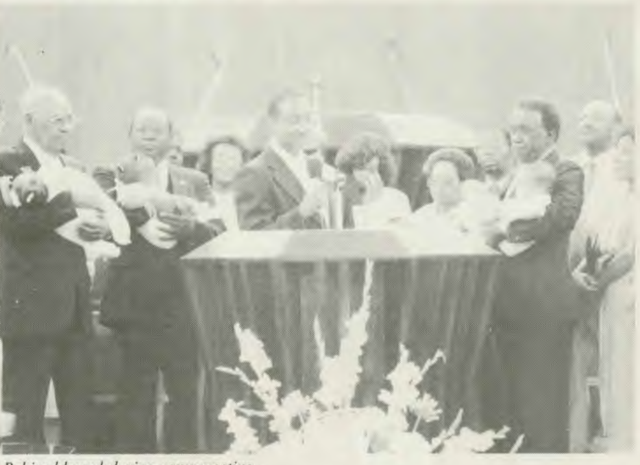
Babies blessed during campmeeting