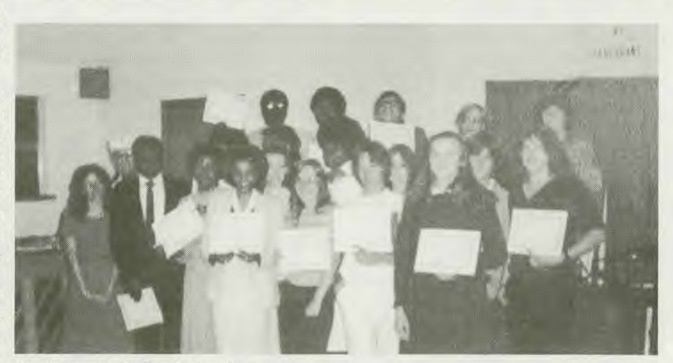
Graduates of the Revelation Seminar.