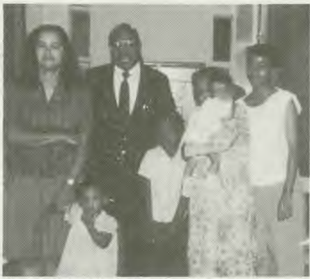
Part of the Curd family after the morning services at the Sedalia church.