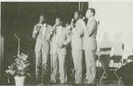
Breath of Life Quartet perform for the Rochester, NY Crusade.

The lay members laid a solid foundation for the crusade. They worked diligently distributing 30,000 handbills and extending personal invitations to relatives and friends. If a handbill or personal invitation failed to reach some of the residents of Rochester, they had only to turn on their radio or television and hear of the upcoming crusade.