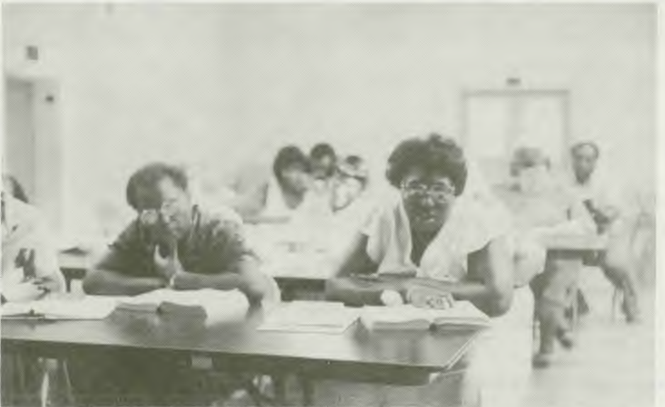
Revelation Seminar held in Humboldt, TN.