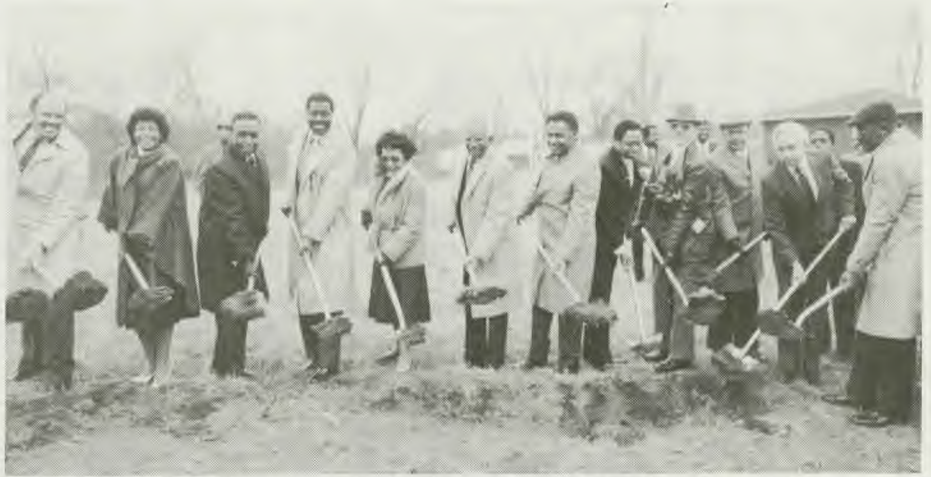
Official ground breaking ceremonies for the new South Central conference office.