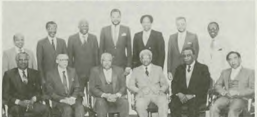
Black leadership meets at Oakwood.