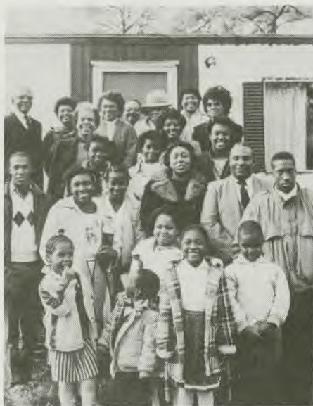
Pastor and members of the First SDA Church—Eutaw, Alabama.