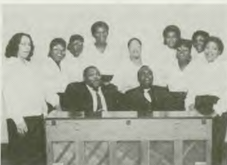
Members of Anchored In Christ.

Director of Religious Instruction, Jefferson Avenue Church