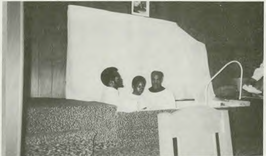
Baptismal service at Kirkwood Seventh-day Church.