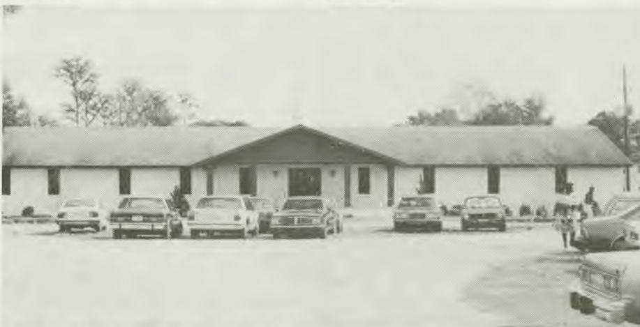
Beracah SDA French Church, Orlando, Florida.