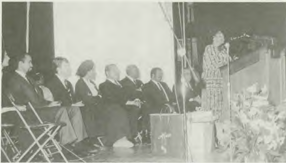
Platform participants of the Breath of Life Crusade.