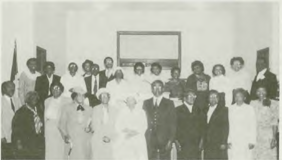
Bethany church members of Montgomery, AL—Still faithful after 33 years.

The Breath of Life Telecasts are presently being aired on the PTL and Black Entertainment television networks. Contributions to help this telecast are needed and are meaningful.