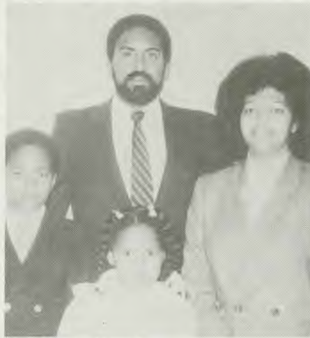
The Dorsey Family.