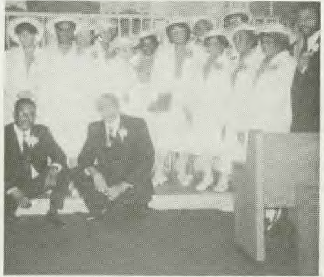
Deacons and Deaconesses of Bronx Temple SDA Church.