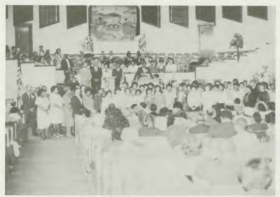
The official delegates to the Central States Youth Caongress.