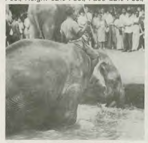
Elephants are still used to help with the labor in some parts of the Fareast.

Burma boasts one the "Wonders of the World"... The Shwedagon Pagoda, built 2500 years ago and believed to enshrine a few strands of Buddha's hair. It towers 328 feet above Rangoon and is visible for miles. Rivalling Schwedagon is Chauk Htat Gyi Pagoda, where a huge reclining Buddha 229.6 feet lays stretched out and is visited by a steady stream of worshippers. Travelling further into the rural area, we viewed an even more impressive object of Burmese worship... The Shwe Tha Lyaling Image (another Reclining Buddha). Its dimensions are: Length– 180 Feet; Height–52½ Feet; Face–22½ Feet;