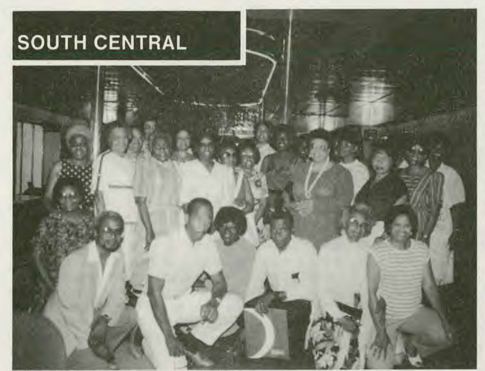
Traveling party of the S.S. Junbilee.