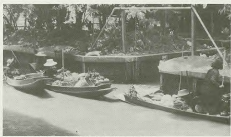
Visits to the "Market on the Water" will long be remembered.