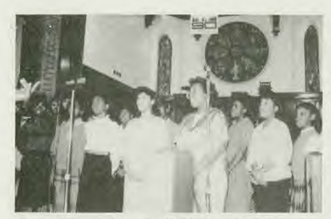
The Berean Youth Choir, a vital part of evangelistic efforts at the Bereab Church.