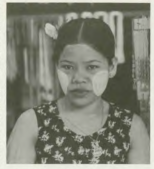
Burmese sales lady in the market.

Our visit to the school educating youth for the life of a monk and the diligence with which all young boys are trained from early childhood to revere and espouse the philosophy and religion of Buddha were evident everywhere. Pagodas and Buddhas abound in bold relief in both urban and rural areas of the countries. The Recumbent Buddha of Thailand, cast in 1321, weighs 54 tons and is visited daily by devout worshippers bearing their offerings.