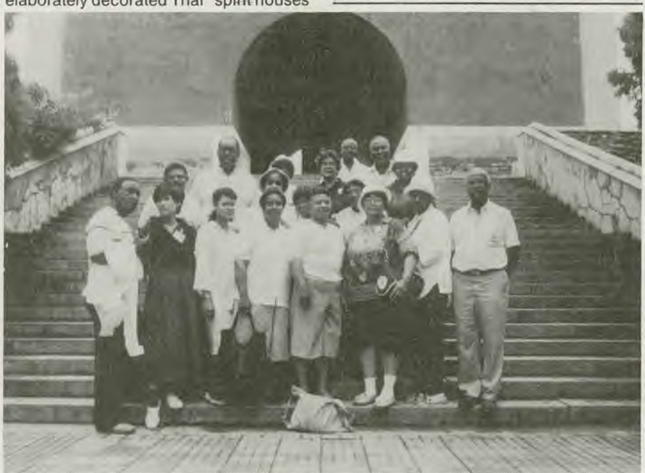
Black S.D.A. members from the NAD pay a visit to the Ming dynasty tomb near Peking, China.