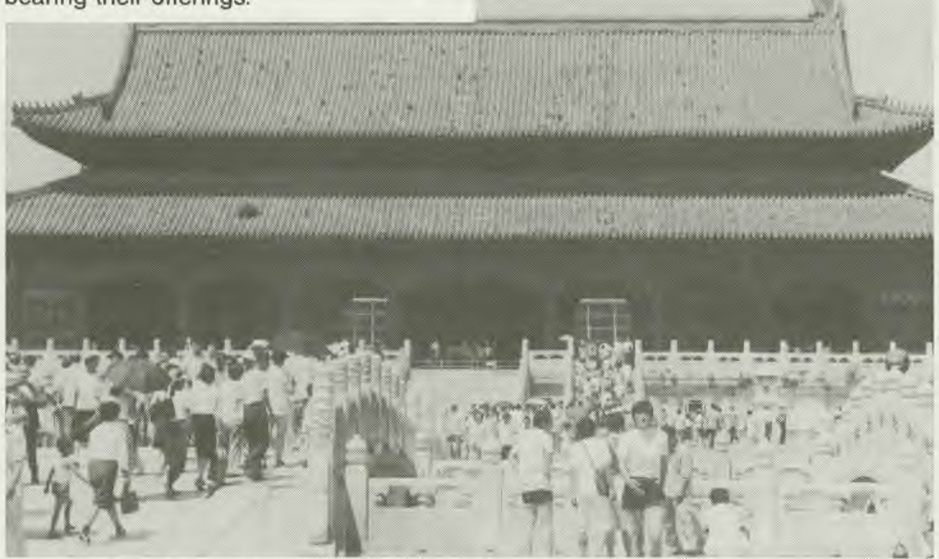
The Forbidden City, a place of beauty is visited by the group.