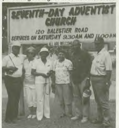
The S.D.A. Work is viewed in Singapore by the visitors. (The Fareast Division of the General Conference).

Throughout Thailand, Burma, and China, worship of Buddha is paramount. 85% of all Burmese are Buddhists and the percentage is higher in some other areas.