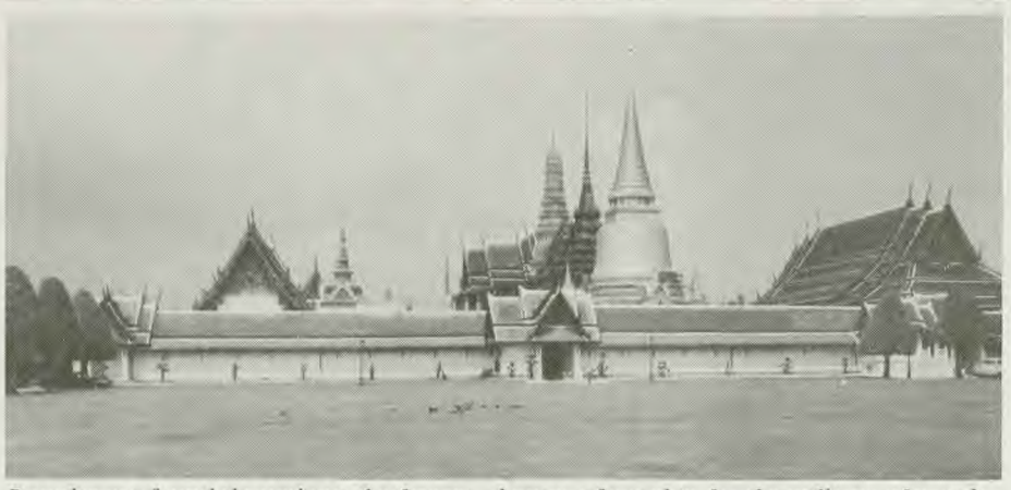
Pagodas are found throughout the fareast—houses of worship for the millions of people.