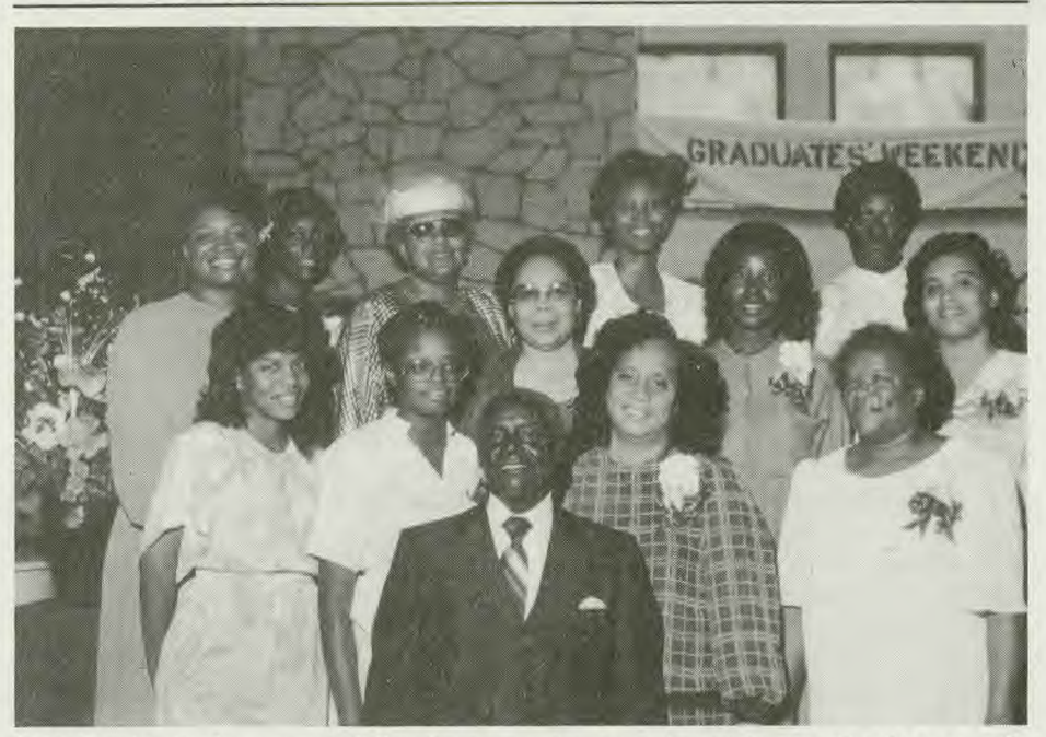
1987 Graduates from around Southeastern who participated in the Conference-wide graduation weekend.