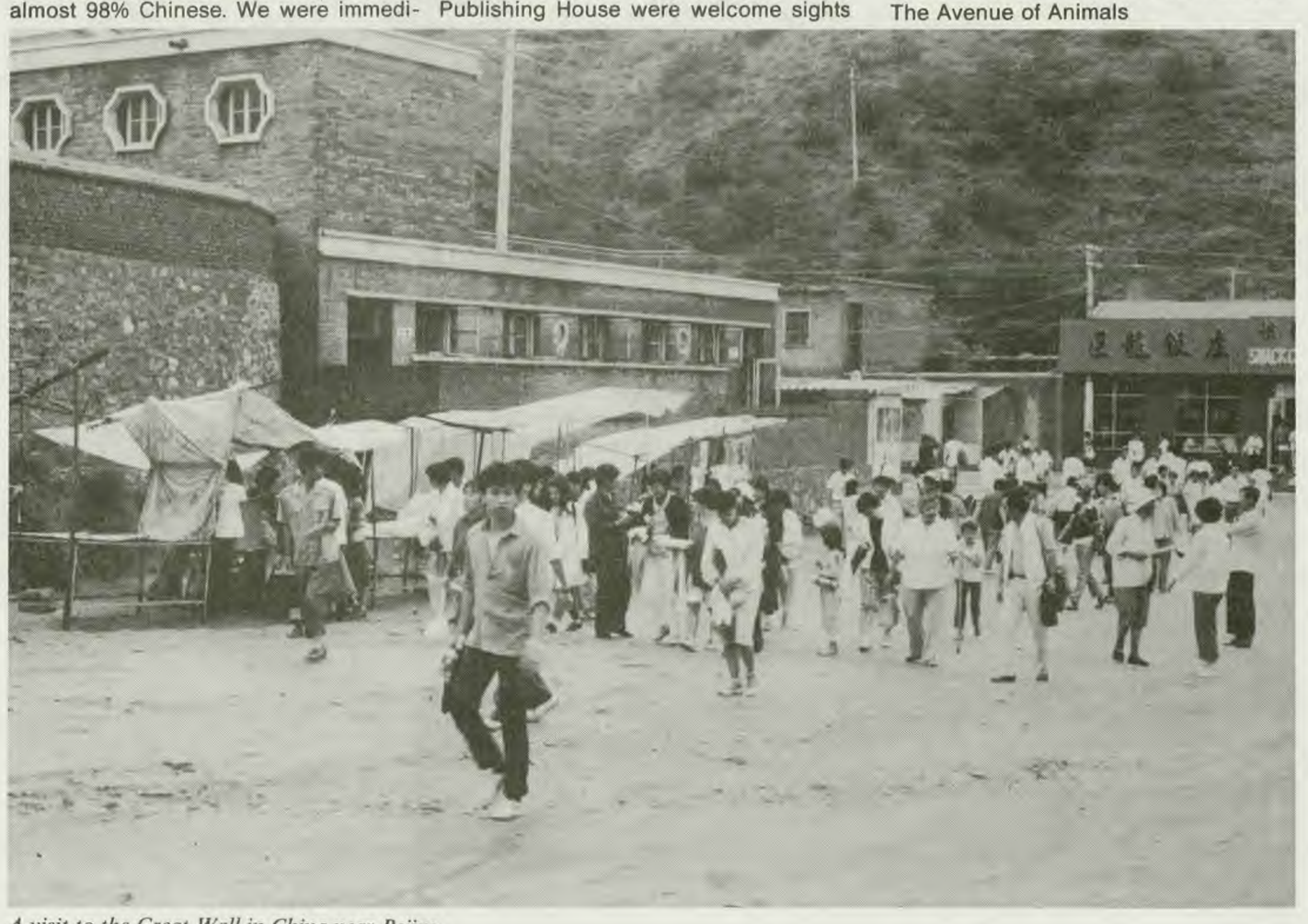
A visit to the Great Wall in China near Bejing.