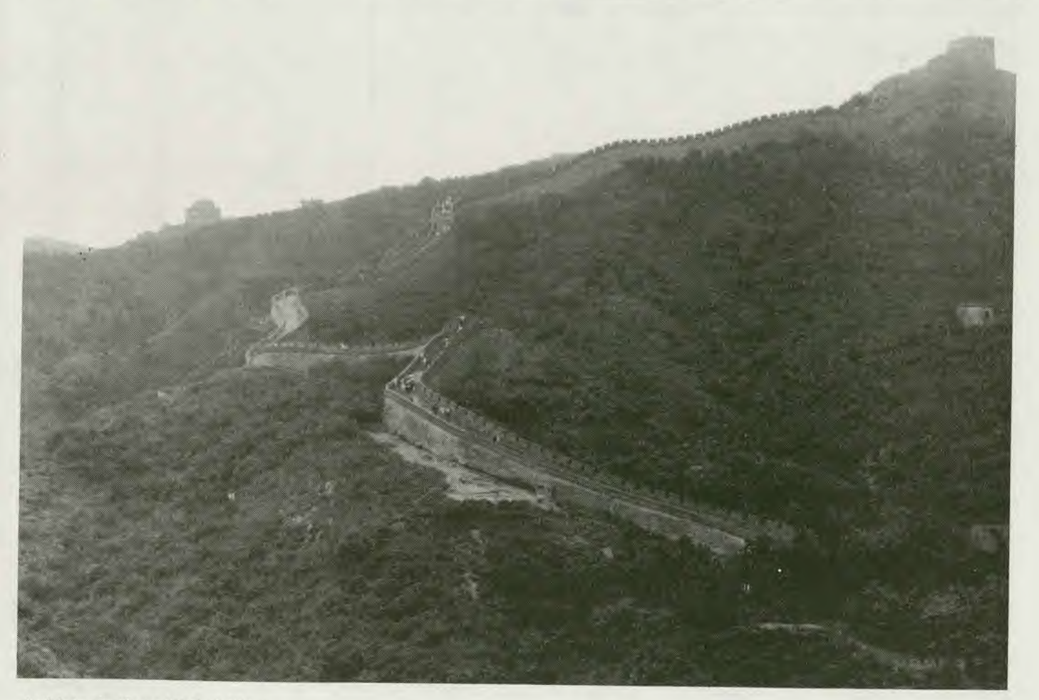
A visit to the Great Wall of China.