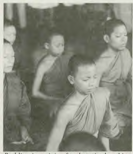
Buddists in training for the priesthood in a school in Thialand.

The uniqueness and beauty of the elaborately decorated Thai "spirit houses"