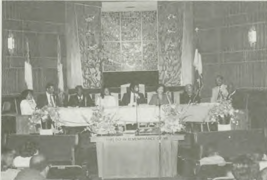
Surrogate Motherhood - Implications for the Church, topic of panel discussion during the 10th Anniversary of the Church of the Oranges.