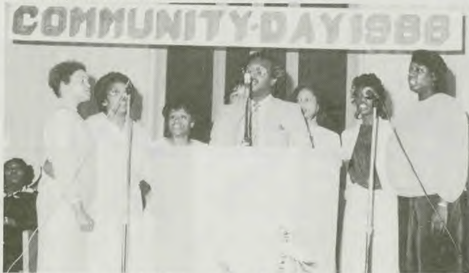
The Testimonies perform for Community Guest Day.

"Praise him for his mighty acts: praise him according to his excellent greatness." Psalms 150:2