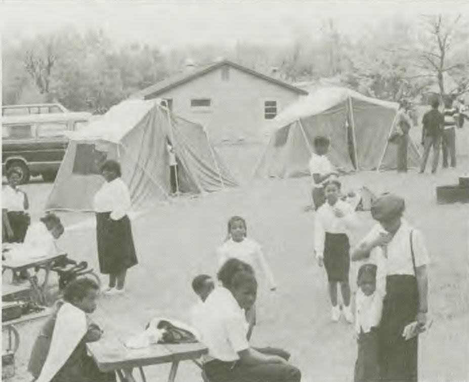
Pathfinders from Dayton, OH, wait on Sabbath dinner.