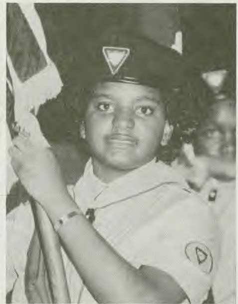
A member of the Shining Stars Pathfinder Club of Springfield, MS, prepares for parade.