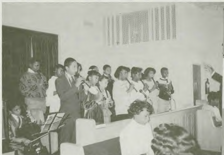
Alcy Recorder Ensemble provides special music for Sabbath School during "Alcy Day" at Breath of Life.