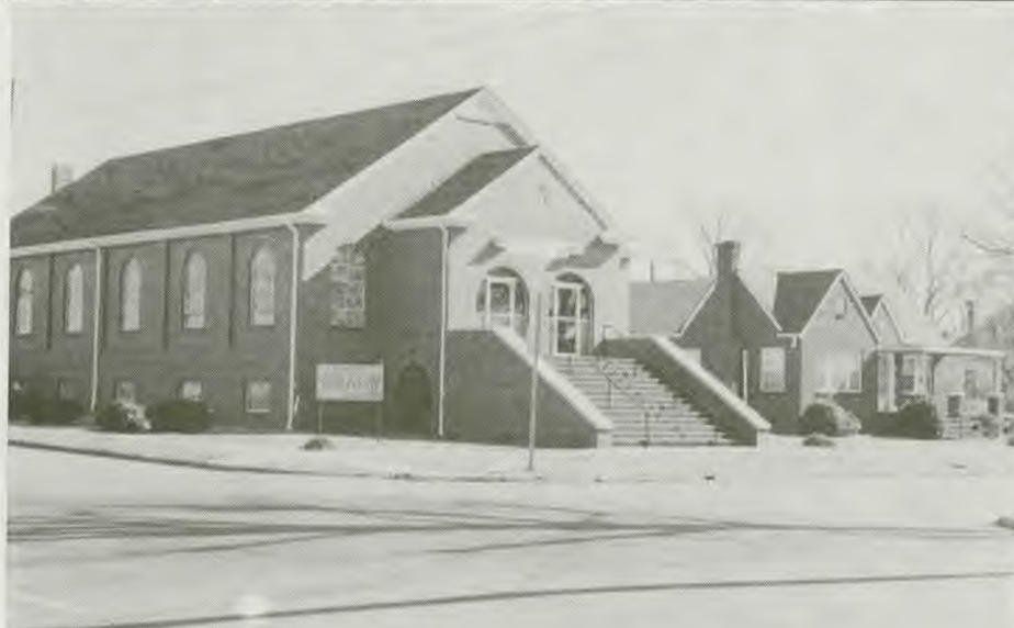
Newly purchased church in Bessemer, AL.