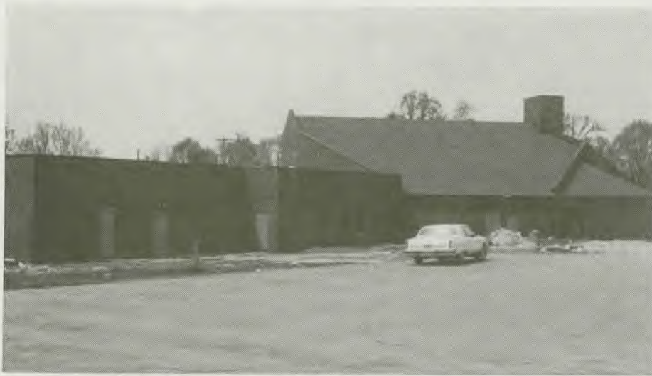
New Covenant Church building, Memphis, TN.