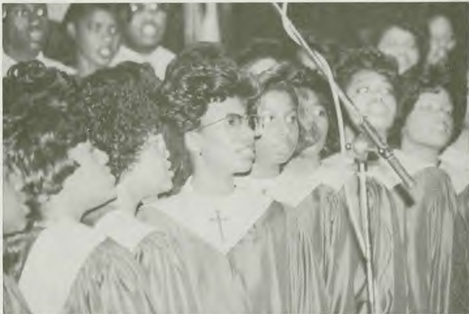
Members of the Pine Forge Academy Choir.