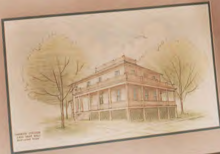
HUNTSVILLE OAKWOOD COLLEGE 1896