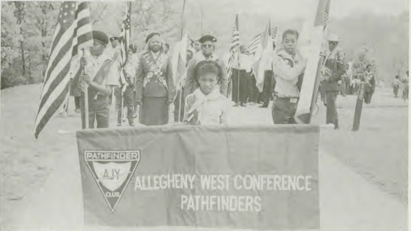
Pathfinders prepare for parade.