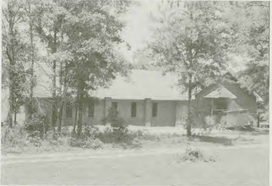
New church building, Daphne, AL.

When the Black leaders came together, requests were made to the parent bodies