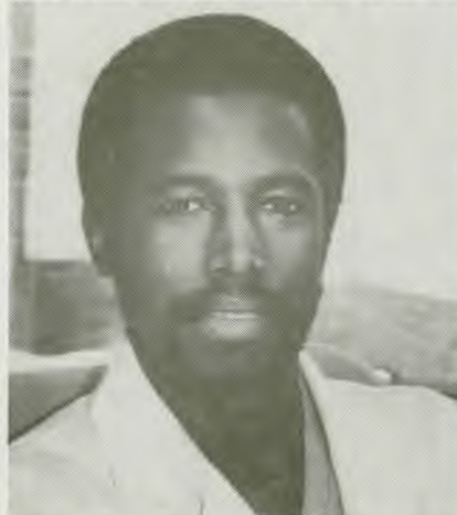
Dr. Benjamin Carson.