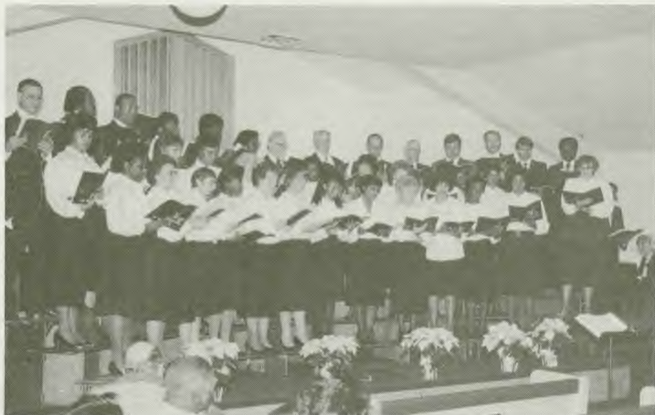
Christmas Cantata Choirs: Sharonaires, Bethesda's Mosher, Pilgrim Presbyterian, Memorial SDA Church.