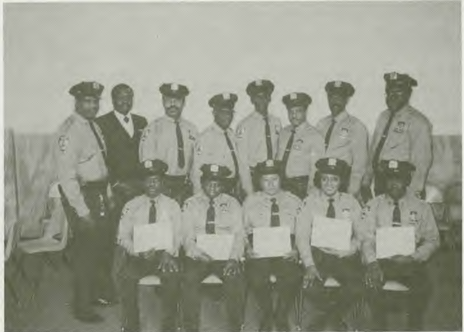
The Hanson Place Auxiliary Police.

hundred literature evangelists serve the country and at regular intervals return to a beautifully appointed conference center to learn more about selling effectively.