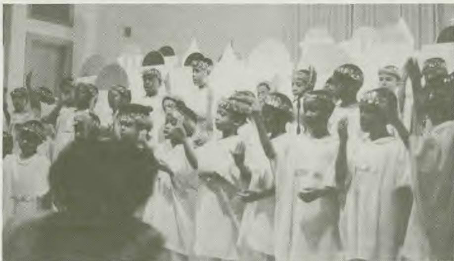
Children sing the song, "Close to Him."