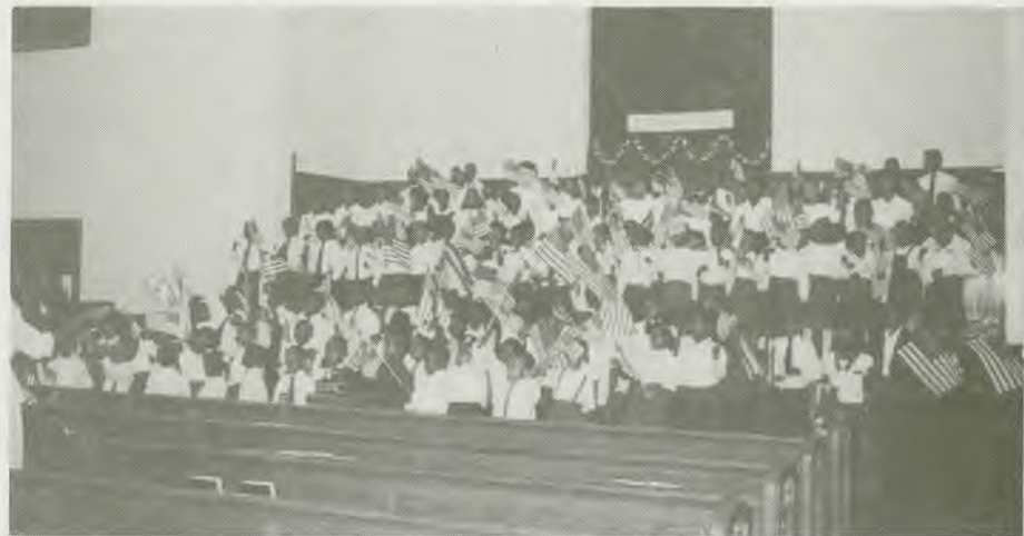
Alcy students sing during the special musical presentation on Oct. 22.

Junior Academy students in the afternoon. The students were dressed in red, white and blue with individual flags. Patriotic songs of the Afro-American as well as the American experience were sung by the student body.