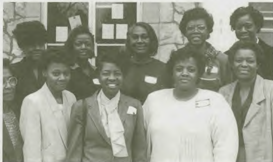
South Central Nurses Association