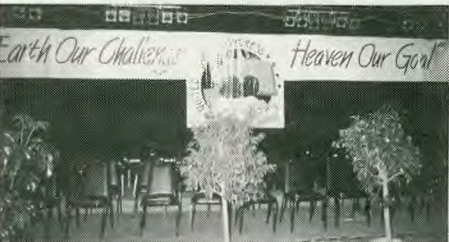
Congress Theme. Backdrop by James Lamb, Atlanta, Ga.