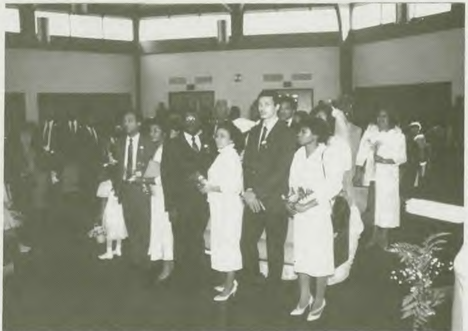
Married couples of the Metropolitan Church renew vows.