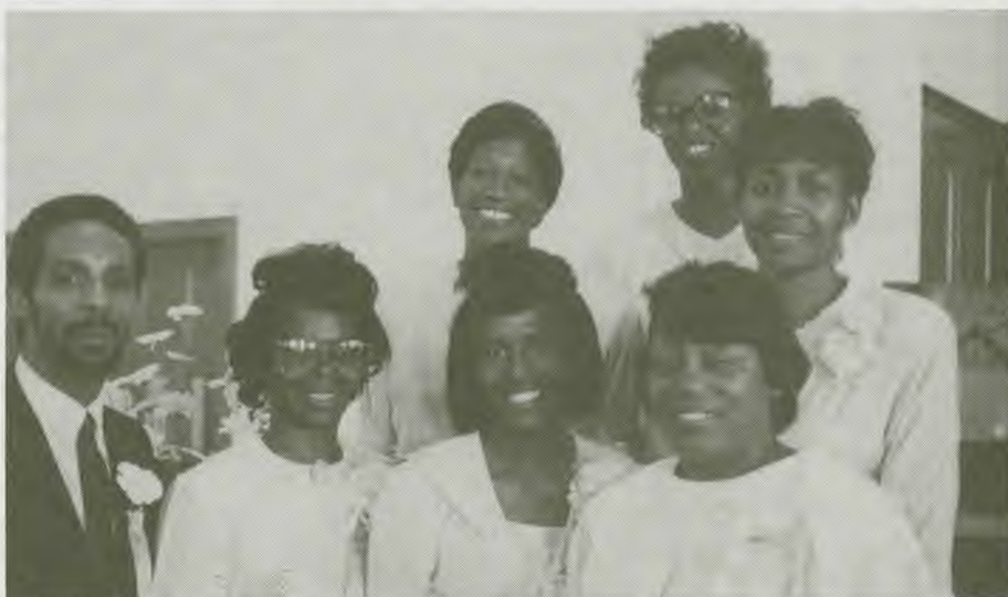
Faculty of Alcy Junior Academy