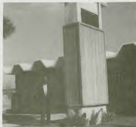
Washington Shores Savings

The Coxes grew up in Washington, D.C., but have served in many places in helping to meet the needs of mankind. They are to be saluted as they take their places in "Moments in SDA Black History."