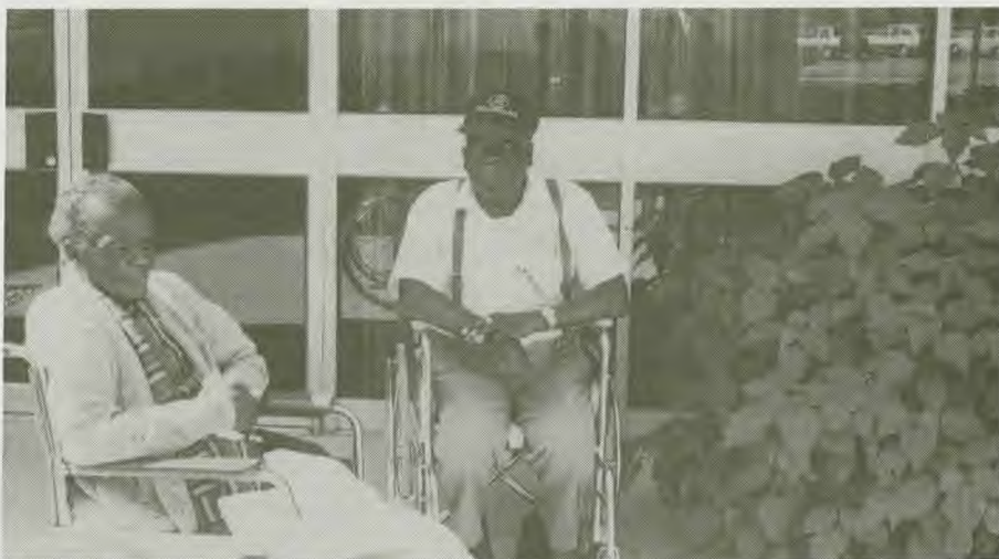
Senior citizens in Orlando, Fla.

Shores Savings Bank, F.S.B., but a name change was only the beginning of many new and exciting changes to come — changes that have clearly demonstrated that WSSB is an institution dedicated to providing a higher quality of service to the community.