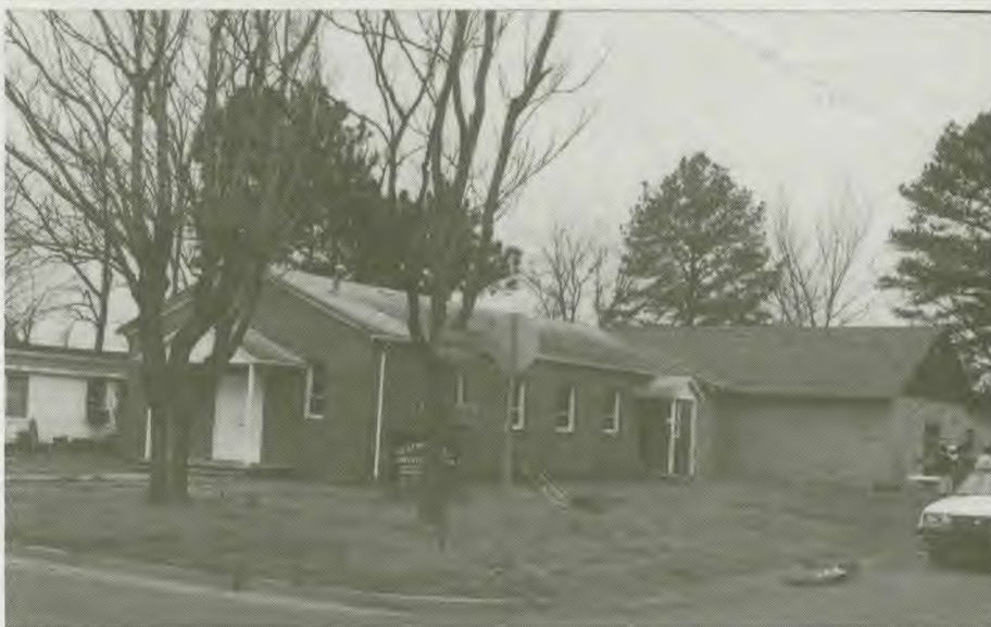
Indianola, Miss., church building.