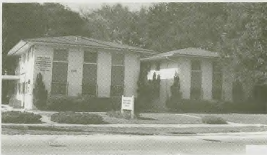
Offices of Cox & Cox & Cox, Orlando, Fla.