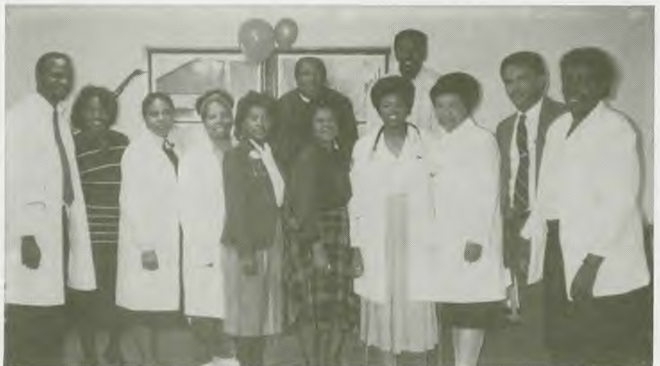
Volunteers at the Spring Valley Health Fair