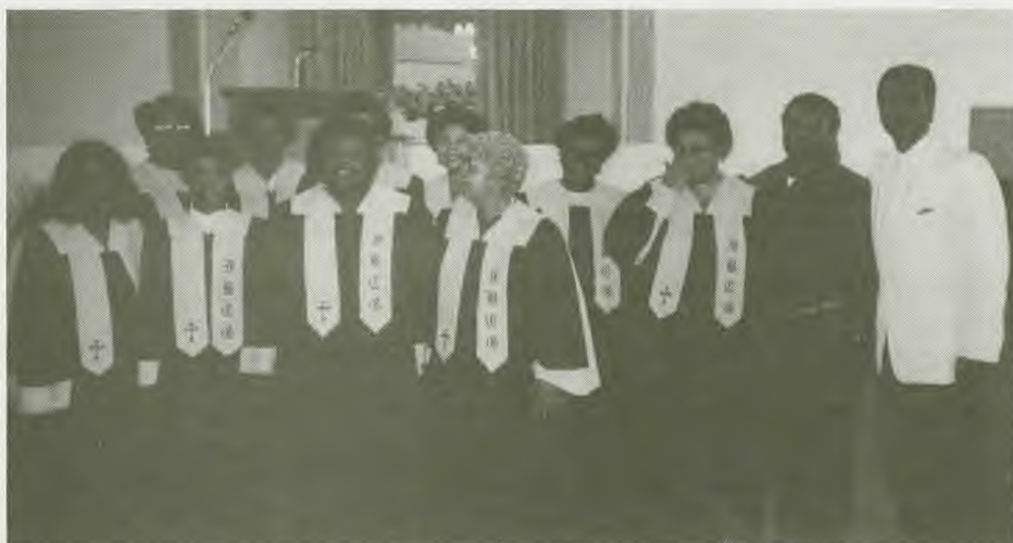
Ebenezer Choir of Gadsden, Alabama.

Sabbath, a library, nursery, and fellowship hall, which was once the sanctuary.