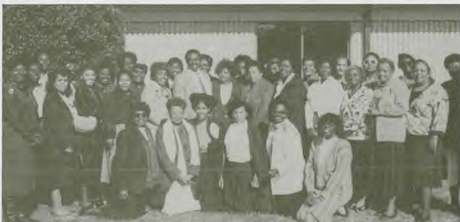
Bible Instructors attend Council on Evangelism at Oakwood.