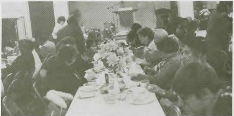
Community guests enjoy their meal at Pioneer Memorial.

For the past three years, the Community Services Department of the Pioneer Memorial SDA Church in Niagara Falls, New York, has sponsored a community