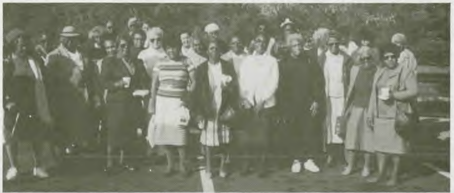
At a highway stop, Allegheny East Senior Citizens pose beneath beautiful autumn foliage.

He who has not yet reached the opposite shore should not make fun of him who is drowning.