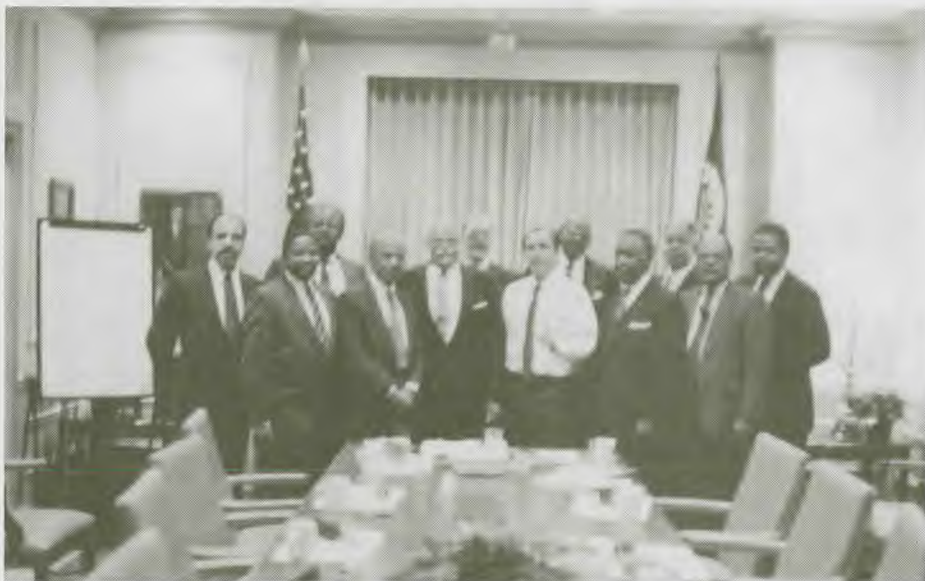
Nashville SDA leaders meet with the mayor of the city, Bill Boner.

Toll Free: 1-800-736-9686 N.Y. City residents: 718-469-9676/9686