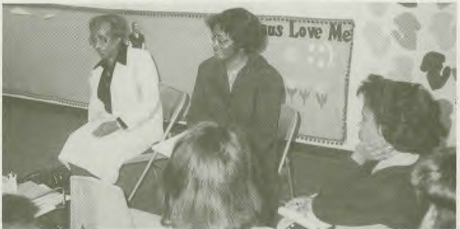
Lower division leaders gain helpful tips for an effective Sabbath School

Training and educating new members and officers in regards to their role and responsibilities was also a need.