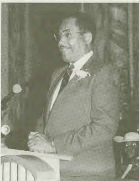
New York Police Commissioner Lee Brown speaks at the King's Daughters service

was New York State's Commissioner of Police, Dr. Lee P. Brown, a friend and colleague of the speaker of the hour, Justice Sheila Jackson Lee who serves in Houston, Texas. The Commissioner used the parable analogy of the Ten Talents regarding Justice Jackson who has demonstrated good stewardship.