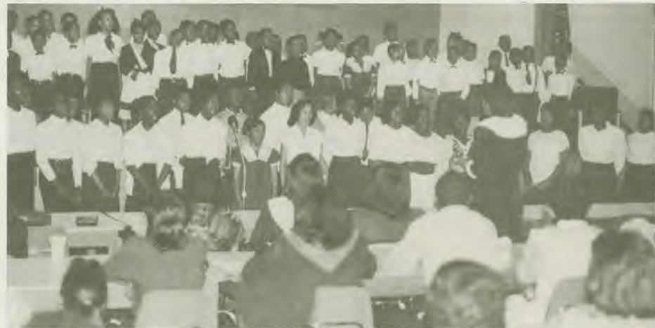
Alcy students presented evening vesper concert at Graceland Junior High School

The third grade class was housed in the portable classroom that is located directly behind the present elementary building. The portable building has 672 square feet with individual climate controlled heating and air conditioning. It is connected to the main building with a covered walkway. Monies for the purchase of the portable building was paid for by the members of the Breath of Life SDA Church. This purchase was initiated by the members of Breath of Life in order that more of their children could enroll at Alcy for the 1989/90 school year. The setup and installation cost of the building was paid for from funds raised through the Alcy Expansion (ALEX) Fund that was collected over the past eighteen months.