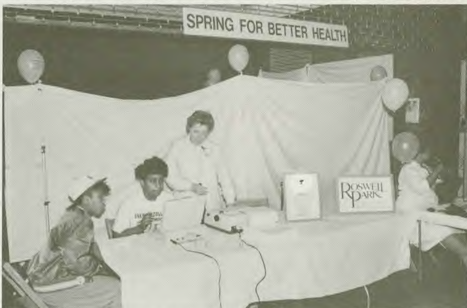
Volunteers and participants at the Spring for Better Health Fair