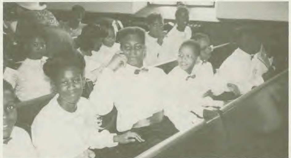
Upperclass students dressed in choir uniforms patiently await their turn to participate in the program