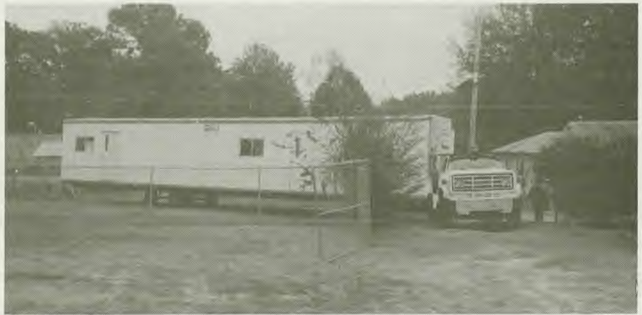
Portable building arrives at Alcy SDA Junior Academy