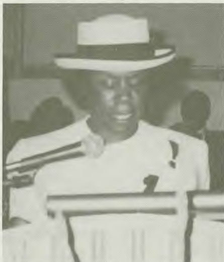
Justice Sheila Jackson Lee