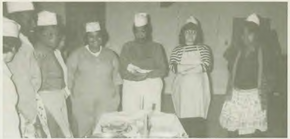
Students of the Beautiful Way Cooking School prepare to sample their creations

was sponsored by the Adventist Churches in Utica, the North-eastern Conference, and the New York Conference.