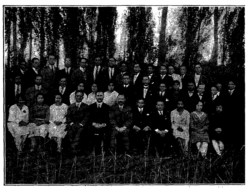
Chile Colporteur Institute

The thirteen regular colporteurs together with the 31 students will give us