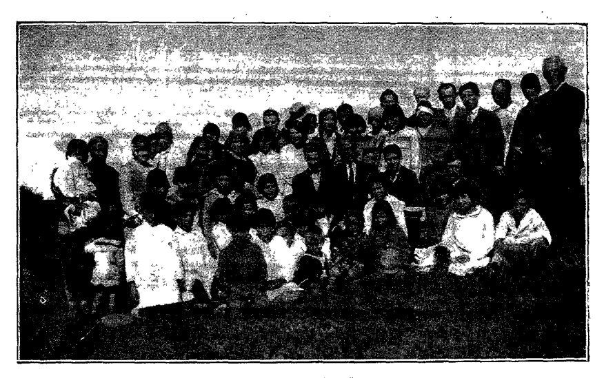
Believers in Paysandú, Uruguay.

On October 17 four persons were baptized. Following this, with the help of Brother Berchín, a church of twenty-five members was organized in this picturesque city of Curacautin, nestled at the foot of the mountains. By the close of the year we hope to baptize ten