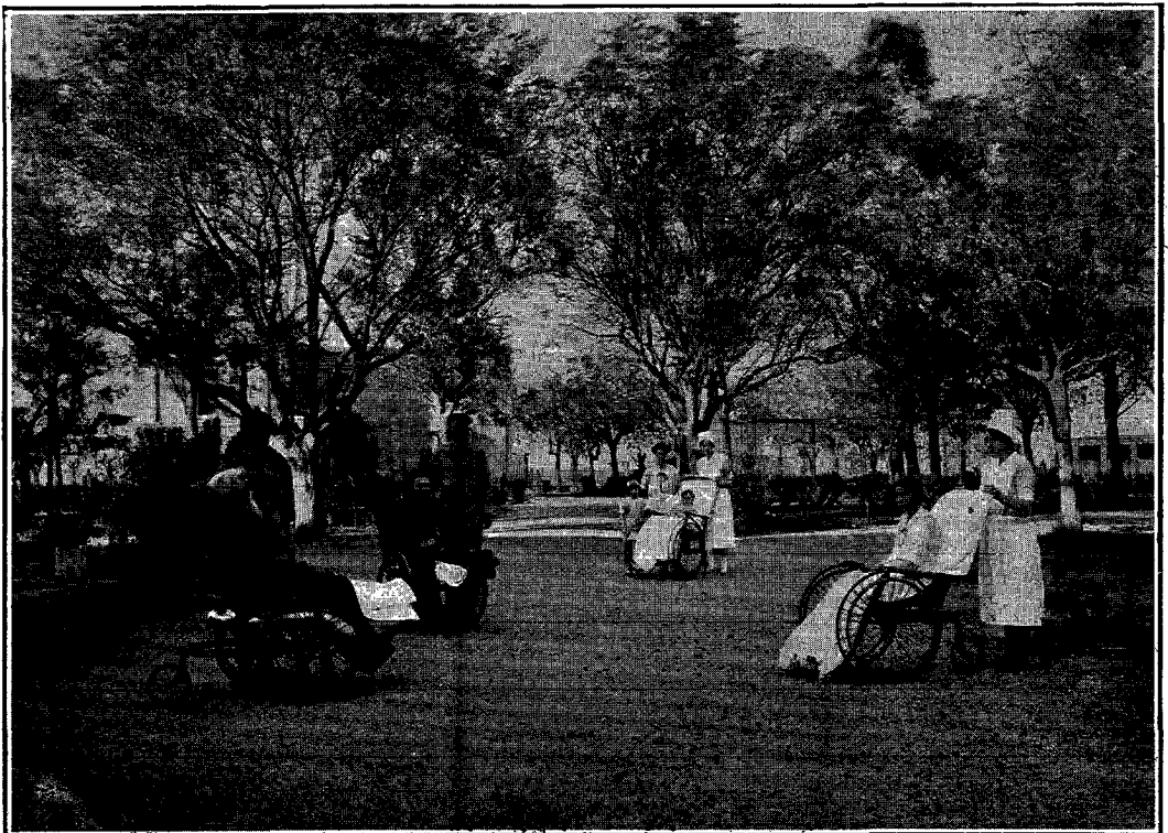
A section of the Sanitarium grounds.