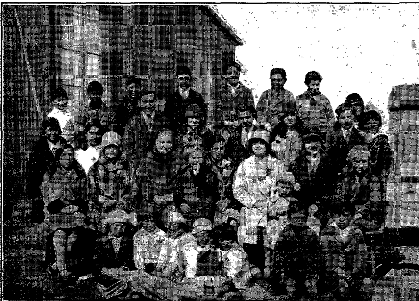
Our southernmost group of believers, Magellan, Chile.

And so it is that years pass by and the missionary work we have done