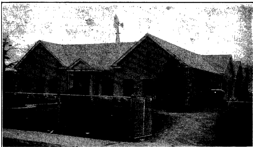
Buenos Aires Publishing House showing the new addition mentioned in the accompanying article.