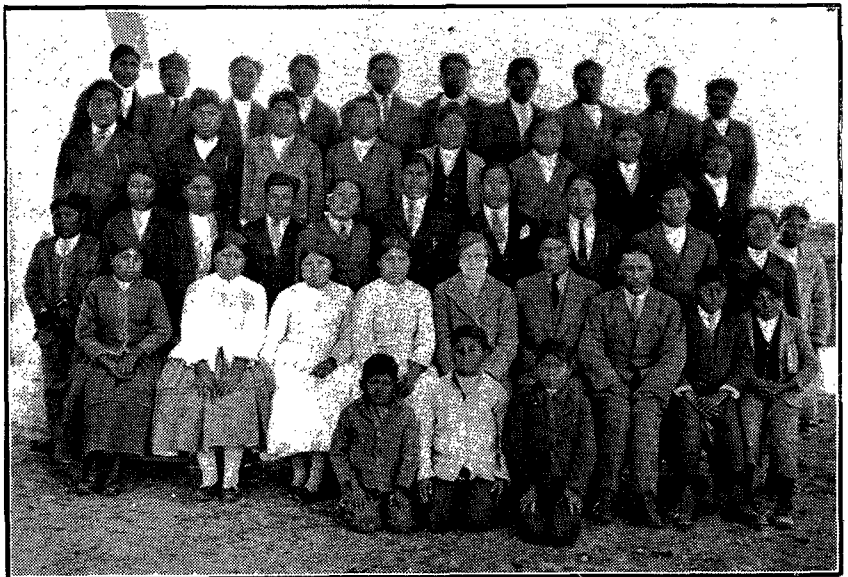
Students attending the Collana workers' training school, 1930.

"God is watching for evidence of our faith, love, and patience."