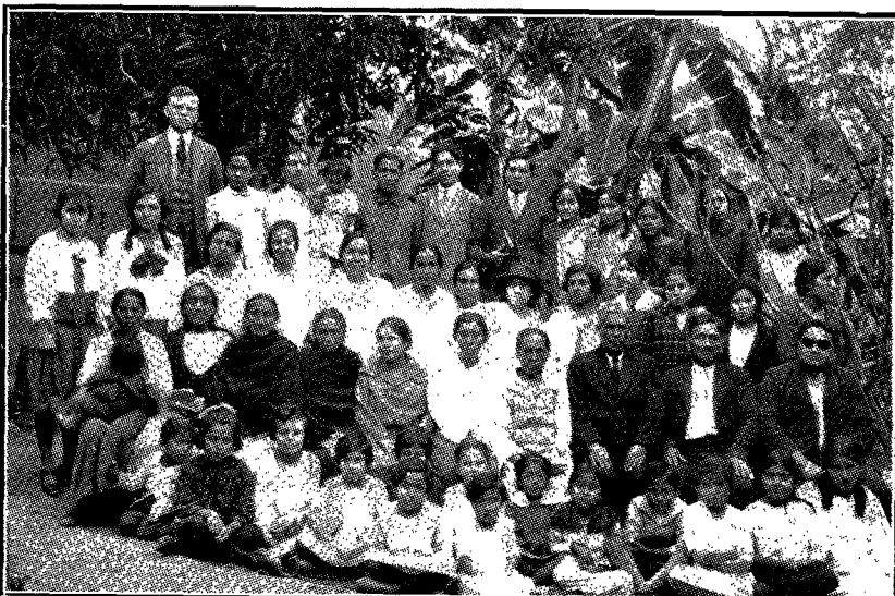
The Acope group, Perú.

The business session was also held at this time. This was carried on rapid-