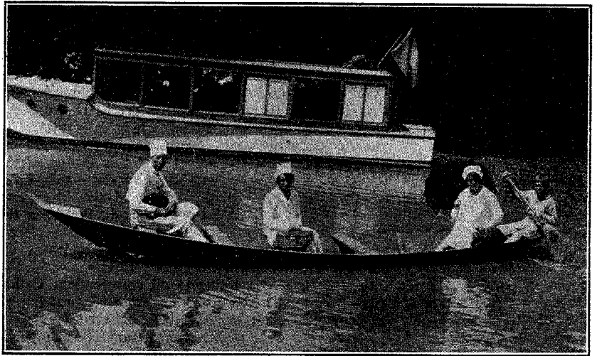
Our mission boat, the "Luzeiro," and our missionaries in a small row boat, in the great Amazon district. Many times they must use a small boat to get to shore. See article, "The Amazon Jungles."