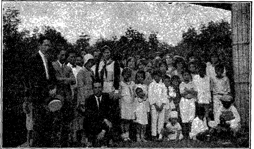
Group of members and recently-baptized believers in Guayaquil, Ecuador.

Christ, the colporteurs of the Central Argentine Conference, by