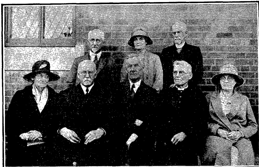
PIONEER WORKERS IN AFRICA

Well do I remember the first reports we received of the beginning of the message in Africa. It caused a thrill to pass through every reader of our good paper. The word that the Spirit of the Lord had gone before us and many had accepted the Sabbath truth in this far-away land, cheered us greatly. Just so the reports today fill us with joy as we read of the advance-