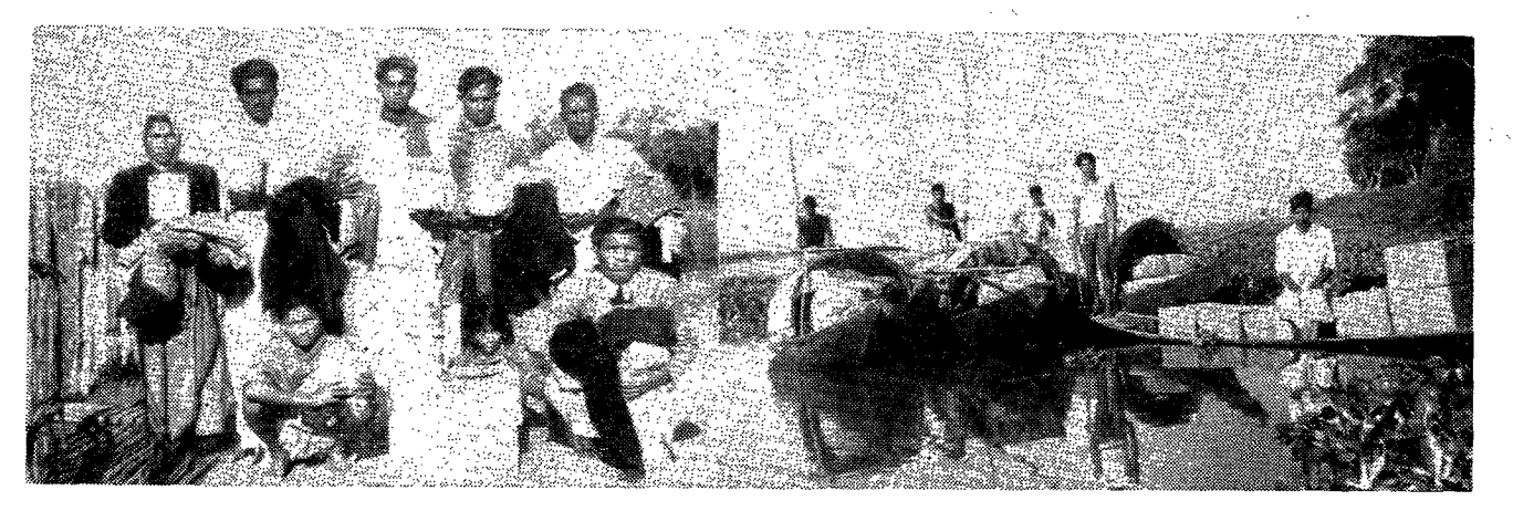
Left: A small group of the many who received gifts of garments and food sent from overseas. Right: Boats ready to leave to the flood sticken areas carrying packages of relief goods.

Once each year when rivers are not too dangerous for small boats we visit our believers in the Sundarbans. Great improvements have been made in this area as the second largest seaport in East Pakistan is now located near our mission station. Travel to this area will no longer be a problem. Numerous tugs, flats, barges and ocean-going steamers stood glistening in the morning sun as we reached the place. The mission motor boat took us into the interior where the population has decreased to one man per acre. The normal tide waves sweep this area twice a day at a speed varying from two to thirty miles per hour. Wells do not yield sweet water and crops are damaged by the sea water. Farmers take a chance in sowing their fields due to unexpected tidal waves. At the present time there is much suffering and want due to crop failure and after-effects of the flood. But our