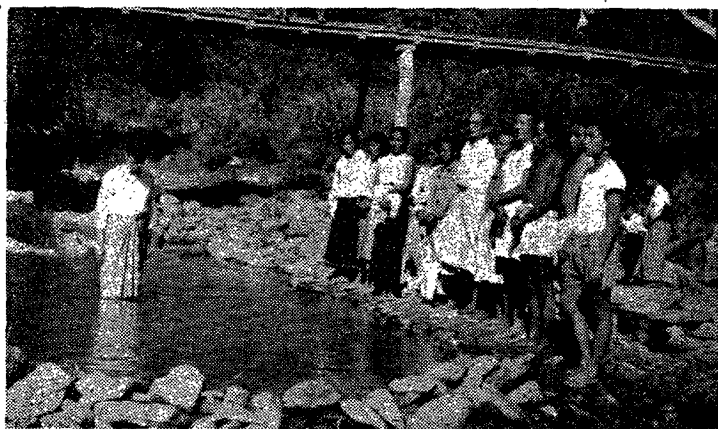
Baptismal service of our first group of believers in the Siyin valley.