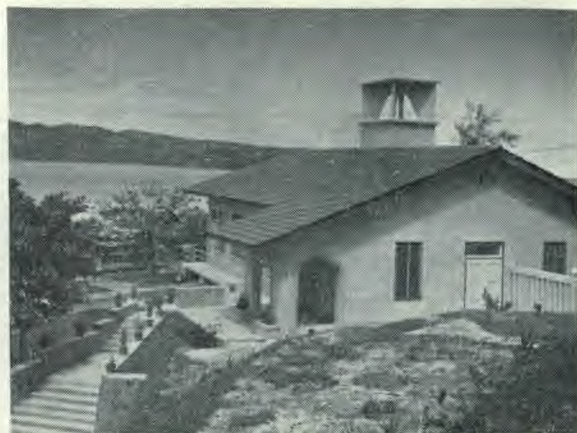
Back view of the Jesselton Church.