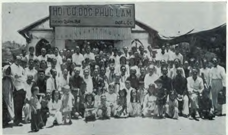
The new Quang Hue church, Vietnam, erected by the members who are standing and sitting in front of the building at the time of its dedication.