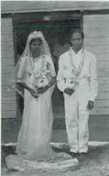
Church members recently married in the Bagon Datoh church. We wish them heaven's richest blessings as they establish their new home.