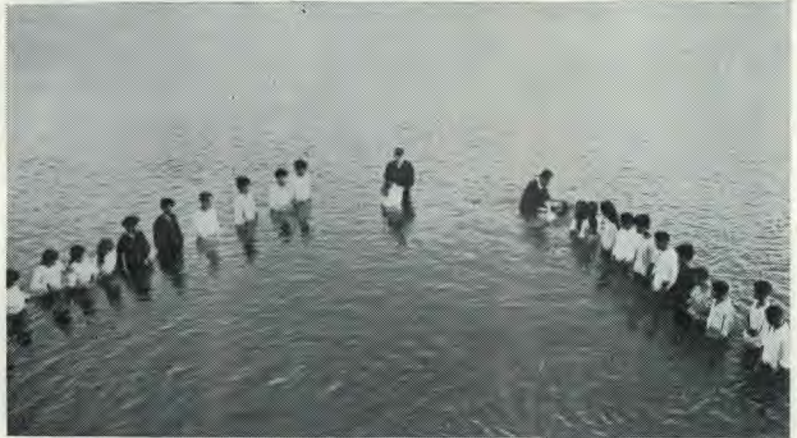
Twenty-four precious souls being baptized to become members in the new Quang Hue Church and the Duc My Church, Vietnam.

meetings in a number of surrounding villages. Each night they lit up the outdoor meeting spot with the gasoline generator and with the loud speaking system attracted large crowds. Everyone came and they insisted on staying as late as eleven o'clock at night for two or three nights. A message was preached then opportunity was given for questions, from those among the audience, about Adventists and what they believe. The last series was held in a village called Quang Hue where a number of members lived who walked quite a distance, taking them two hours to reach the Duc