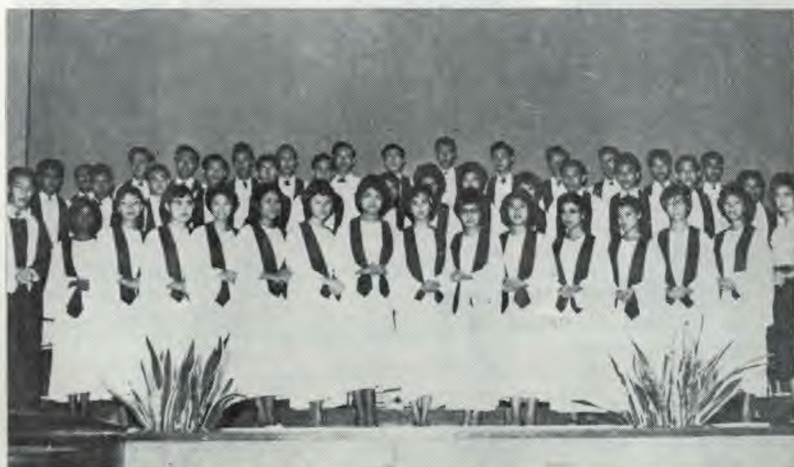
SAUC COLLEGE CHOIR

long remember the wholesome musical treat which was provided for them on July 19.