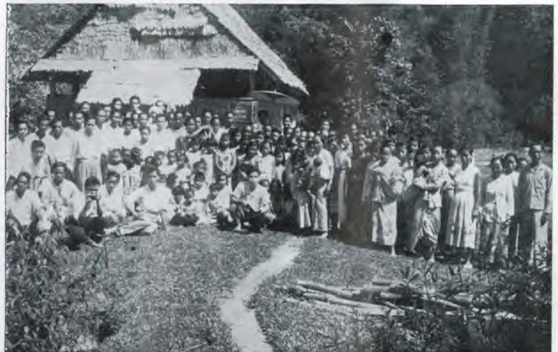
One of the interior church groups with whom the Training class held an effort standing outside their church building.