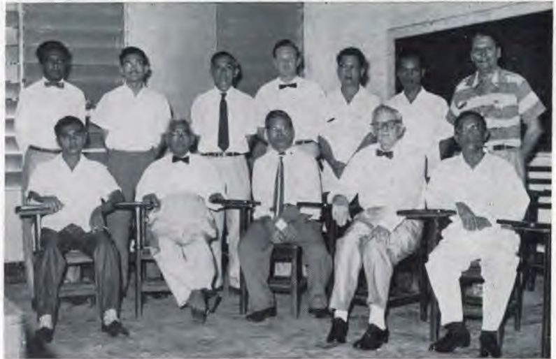
Sidang Advent workers attending the Mission Session held January 7, 8, 1959.

Viewing the great challenge before us I think of ancient Israel, who, after it seemed to them they had conquered Canaan, they heard the words of Joshua "... there remaineth yet very much land to be possessed," Joshua 13:1. So it is in our field; "very much" remains to be possessed. Were it not for the higher command from God Himself saying "Speak unto the children of Israel that they go forward," we would, indeed, have reason to be discouraged. From human reasoning our advance to victory is as impossible as it was to Israel before the Red Sea. Yet, as Israel obeyed, the way opened. So it will be with Israel today. Brethren, let us press forward to victory!